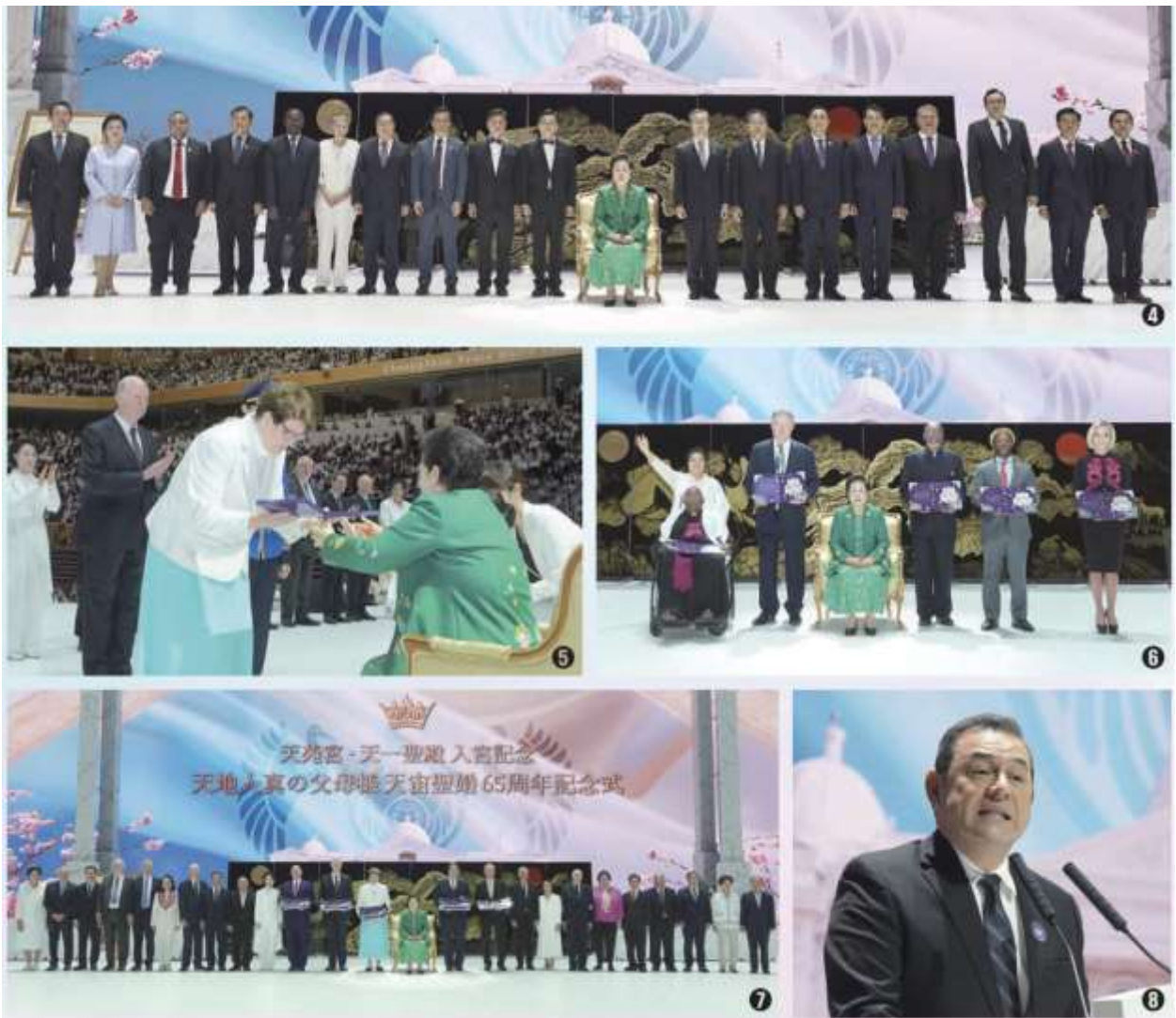
④ Offering of Gifts from each Continental Region ⑤~⑦ Special Awards for Meritorious Individuals ⑧ Former President of Guatemala Jimmy Morales Giving His Congratulatory Address