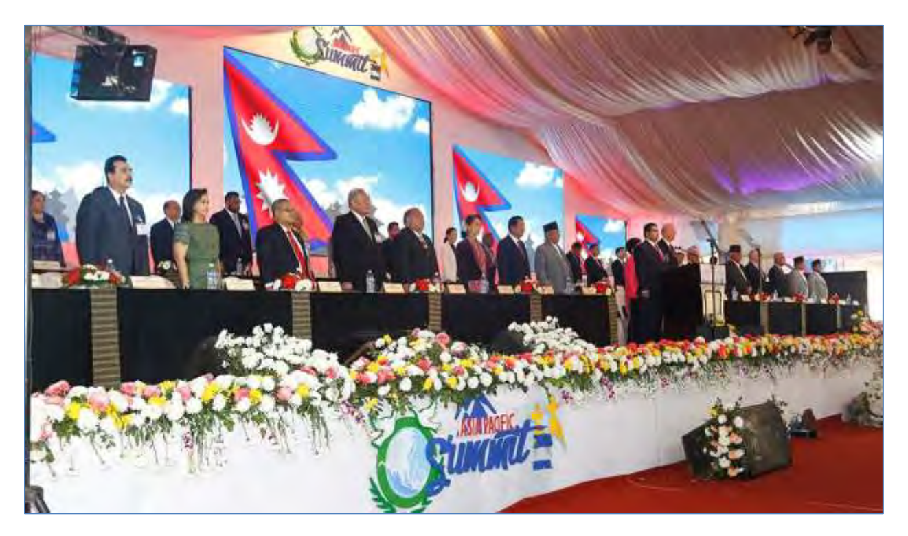
Kathmandu, Nepal – November 30 – December 3, 2018

The Asia Pacific Summit 2018 – Nepal was held in Kathmandu, Nepal from November 30 to December 3, 2018 at the Hyatt Regency Hotel. The Summit theme was, "Addressing the Critical Challenges of Our Time: Interdependence, Mutual Prosperity and Universal Values."