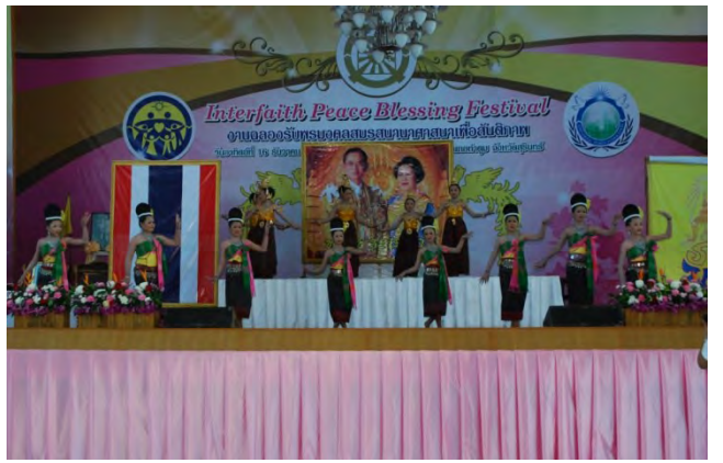
Thai Dance for welcoming and honor The King and Queen, performed by students of Nong Bua school