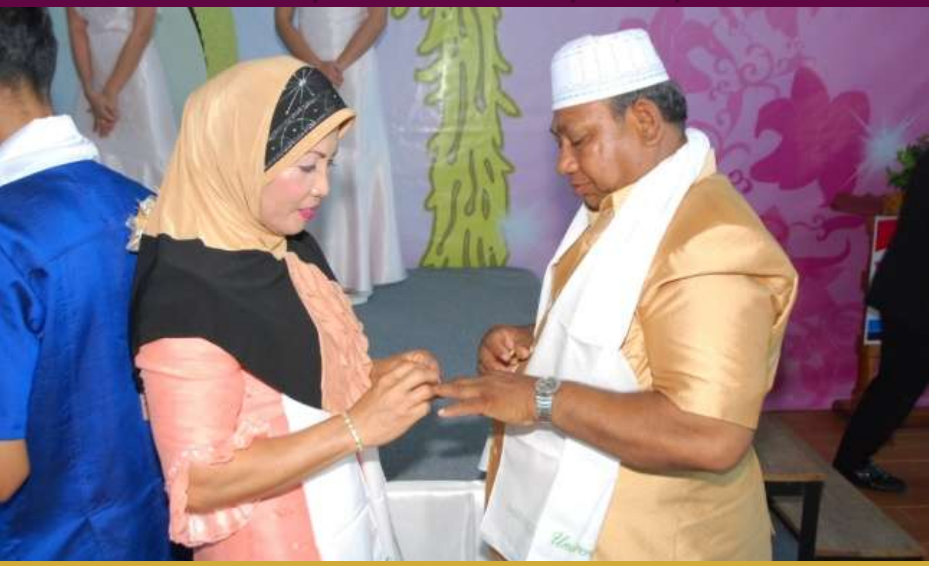
Muslim wife put the ring to her husband in exchanging ring ceremony