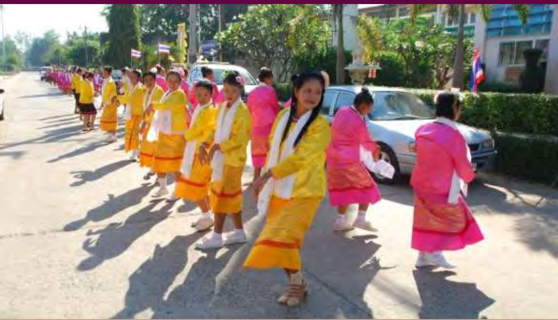
Long Drum Traditional Dance by 200 women of Nong Bua Village to welcome Interfaith Peace Blessing Festival