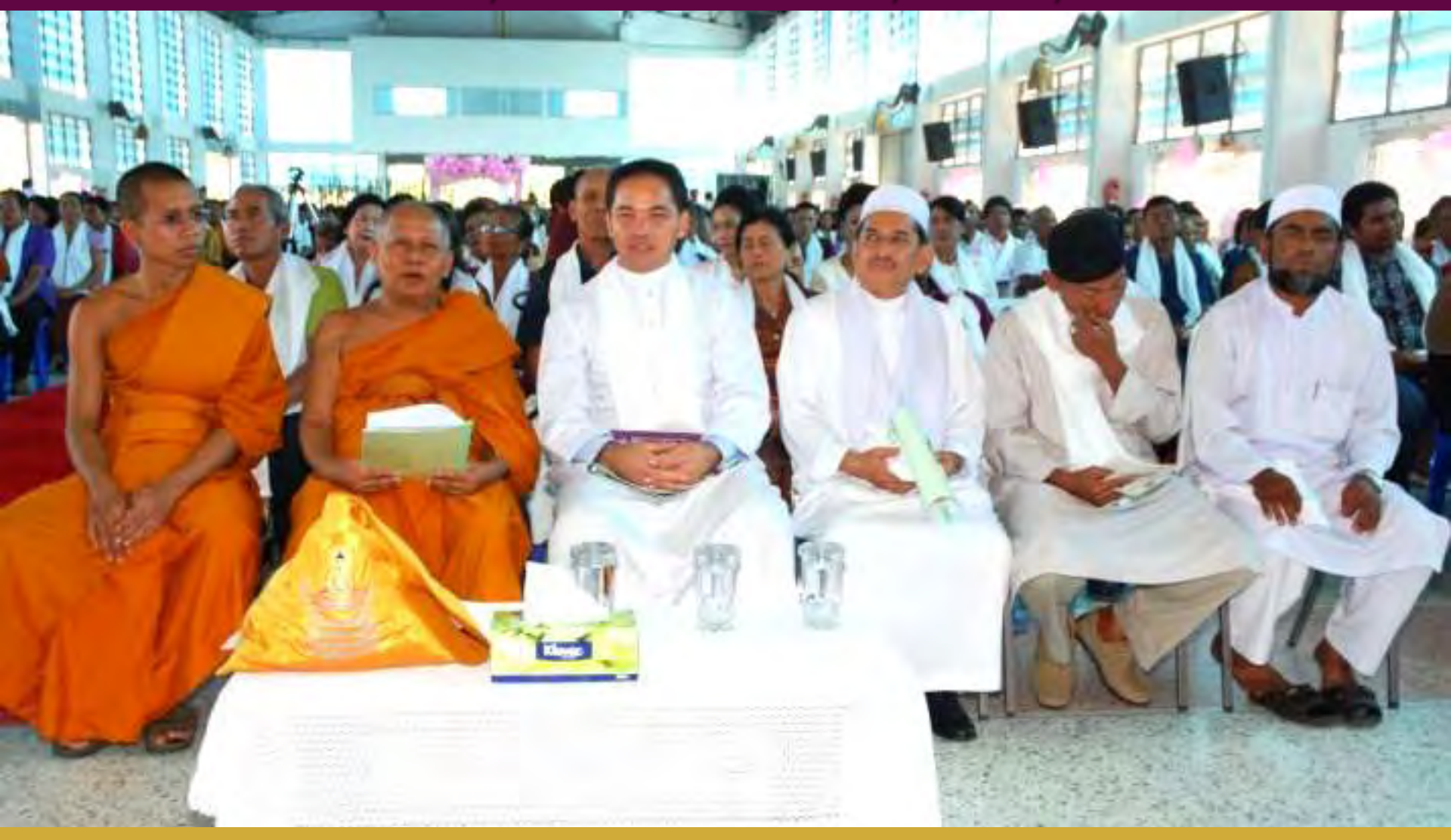
Top level Buddhist Monk, Catholic Priest and Muslim Imam in Surin Province.