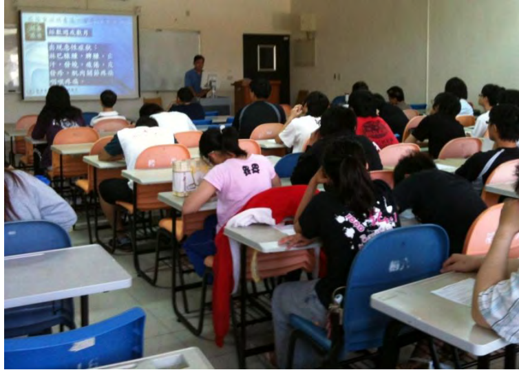
Speech on Drug Abuse and AIDS Prevention Campaign on Campus

WFWP is preparing the 2011 AIDS Prevention & Anti- Drug campaign by advertising through posters, bus, radio, TV and interactive Q &A on internet. This campaign targets youth groups and students from fifth grade until the age of 30. Youth is the future hope of a nation, but there are many of them who live in horror and grief due to irreparable mistakes committed out of ignorance. This campaign will reach out to students through interactive ways like role-play, activities, and guizzes during the lecture when the schools open in September. WFWP educates students with the basic knowledge on AIDS Prevention, and guides them with correct perspectives on gender issues based on pure love education.