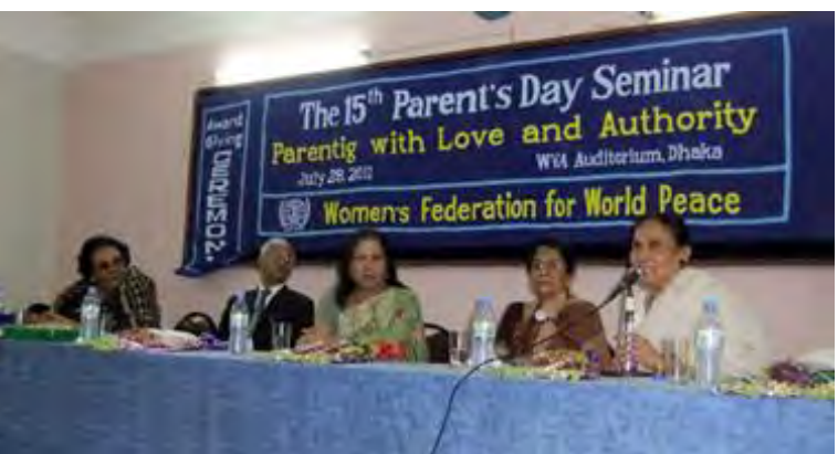
The panel speakers at the seminar