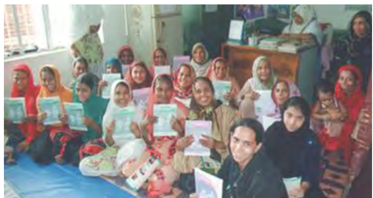
Mothers also began to learn how to read and write