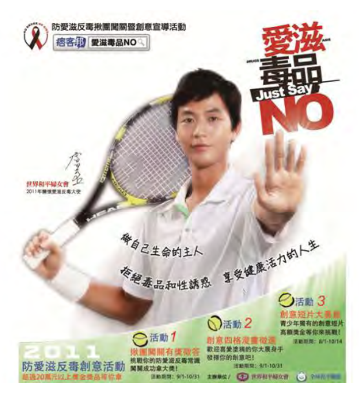
2011 Spokesman: Rendy Lu Yen-hsun Famous Tennis Player

WFWP is preparing the 2011 AIDS Prevention & Anti- Drug campaign by advertising through posters, bus, radio, TV and interactive Q &A on internet. This campaign targets youth groups and students from fifth grade until the age of 30. Youth is the future hope of a nation, but there are many of them who live in horror and grief due to irreparable mistakes committed out of ignorance. This campaign will reach out to students through interactive ways like role-play, activities, and guizzes during the lecture when the schools open in September. WFWP educates students with the basic knowledge on AIDS Prevention, and guides them with correct perspectives on gender issues based on pure love education.