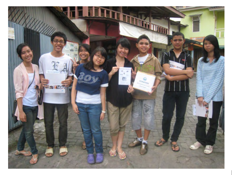
Group of Youth Ambassadors gathering to set out for fund raising.

As the result of the neighborhood survey, these young Ambassadors for Peace decided to conduct free math tuition classes for elementary children at the UPF Peace Center. During their first planning meeting on July 19, they made a donation box and collected donations from the shops in the vicinity to buy stationeries for the kids. Then they visited the families and invited the children who had expressed their desire to study math with our students.