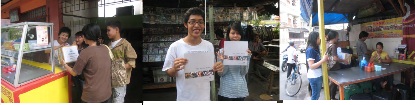
Food vendors supporting the donation efforts!

The next week 6 children came for the first class. Our volunteers poured out their hearts to teach the children, not only math, but also song and dance. Due to the sincerity of our YAFPs, the number of students is increasing each week.