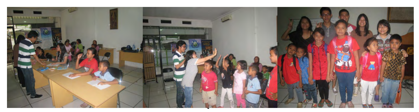
Youth Ambassadors providing free math with activities they teach to kids from community