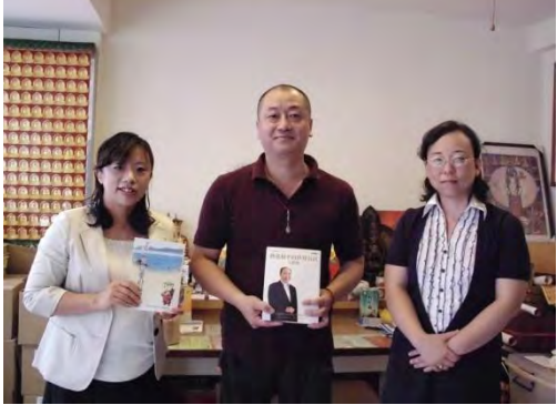
Japanese International Volunteers visiting Peace Ambassadors and presenting True Father's autobiography.