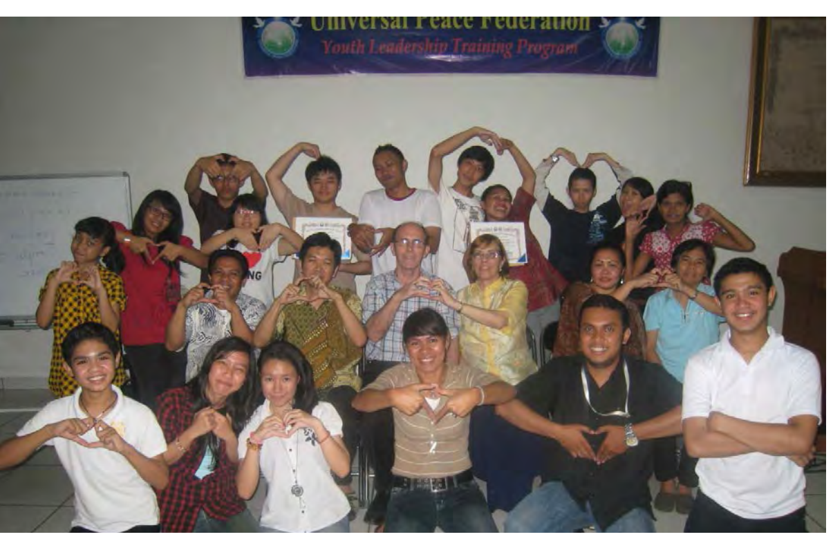
Newly appointed Youth Ambassadors after the 3rd 4-Day Training from 6-9 July.