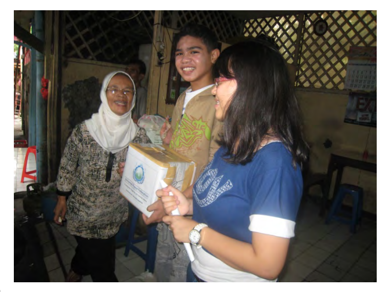
Youth Ambassadors going from house to house asking for donations from local shop owners

As the result of the neighborhood survey, these young Ambassadors for Peace decided to conduct free math tuition classes for elementary children at the UPF Peace Center. During their first planning meeting on July 19, they made a donation box and collected donations from the shops in the vicinity to buy stationeries for the kids. Then they visited the families and invited the children who had expressed their desire to study math with our students.