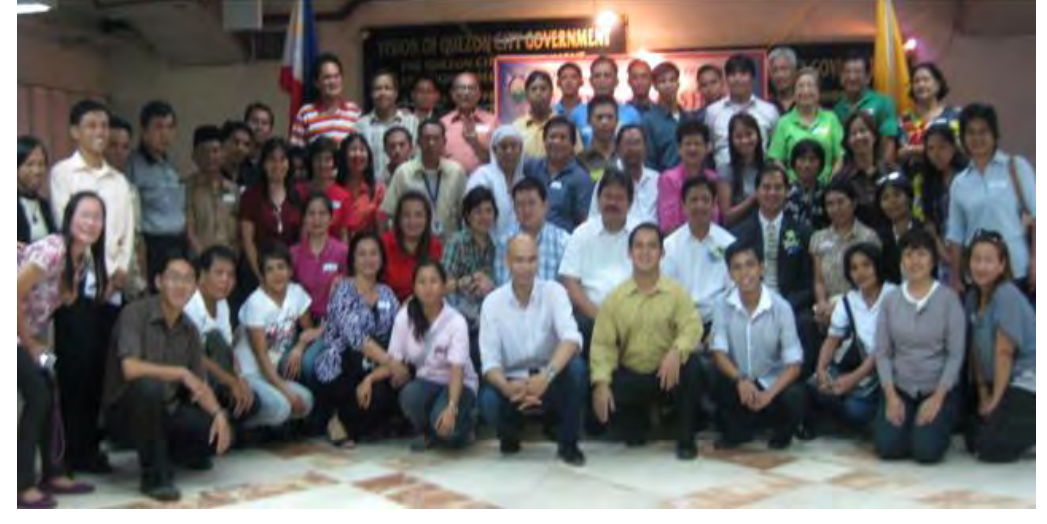
Participants and staff of the UPF Seminar in Quezon City posed for a commemorative group photo