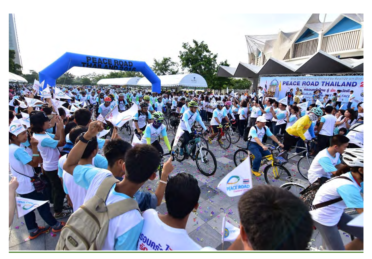
Peace Road 2016 in Thailand (July 24, 2016)