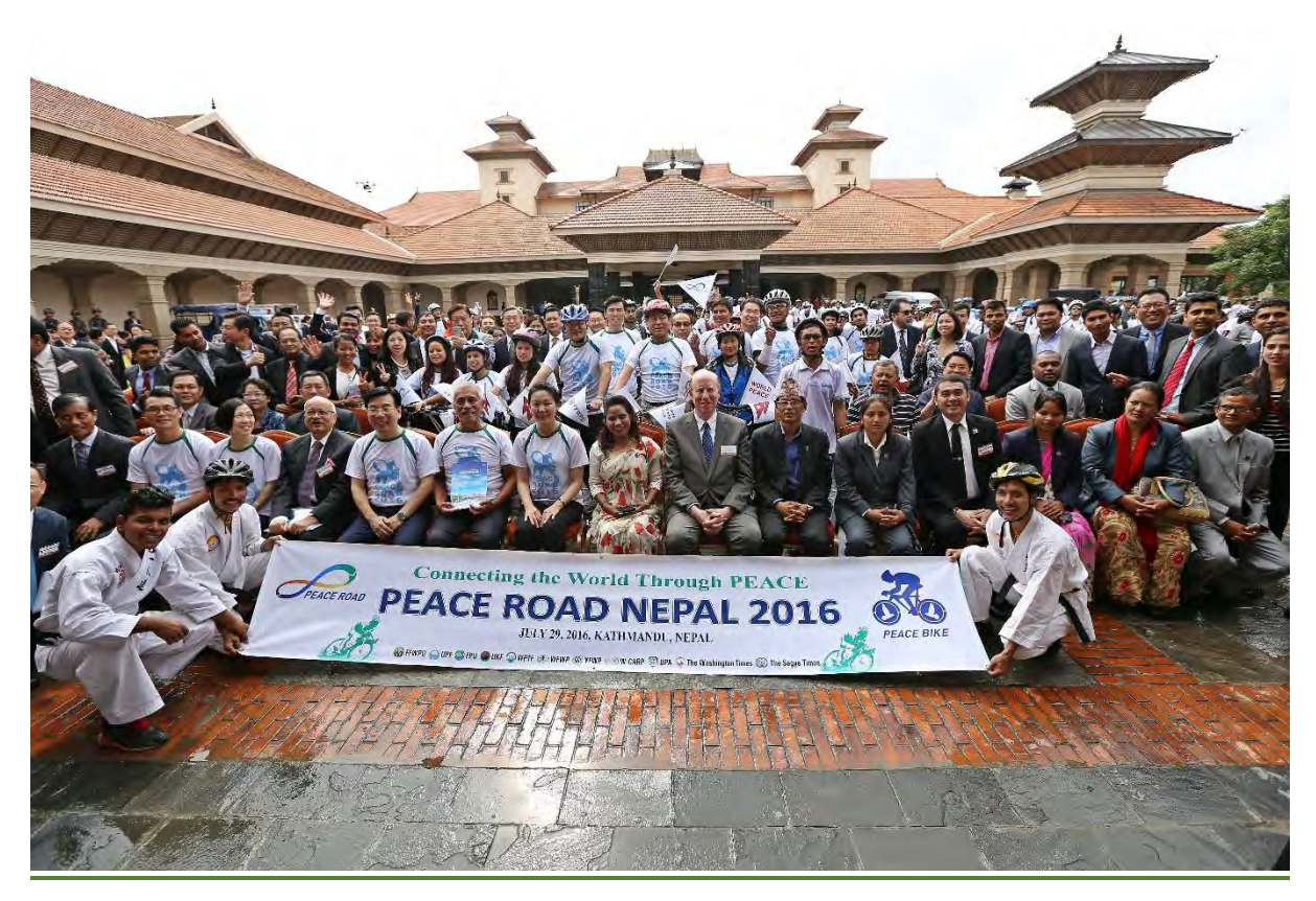
Peace Road 2016 in Nepal (July 29, 2016)