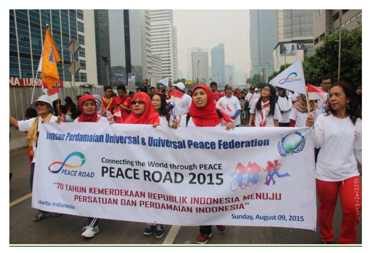
Peace Road 2015 in Indonesia (August 9, 2015)

We earnestly hope that with each step we take, more people can join us and be hopeful. Then, that earnest desire for peace amongst people can go beyond just hope and become reality.