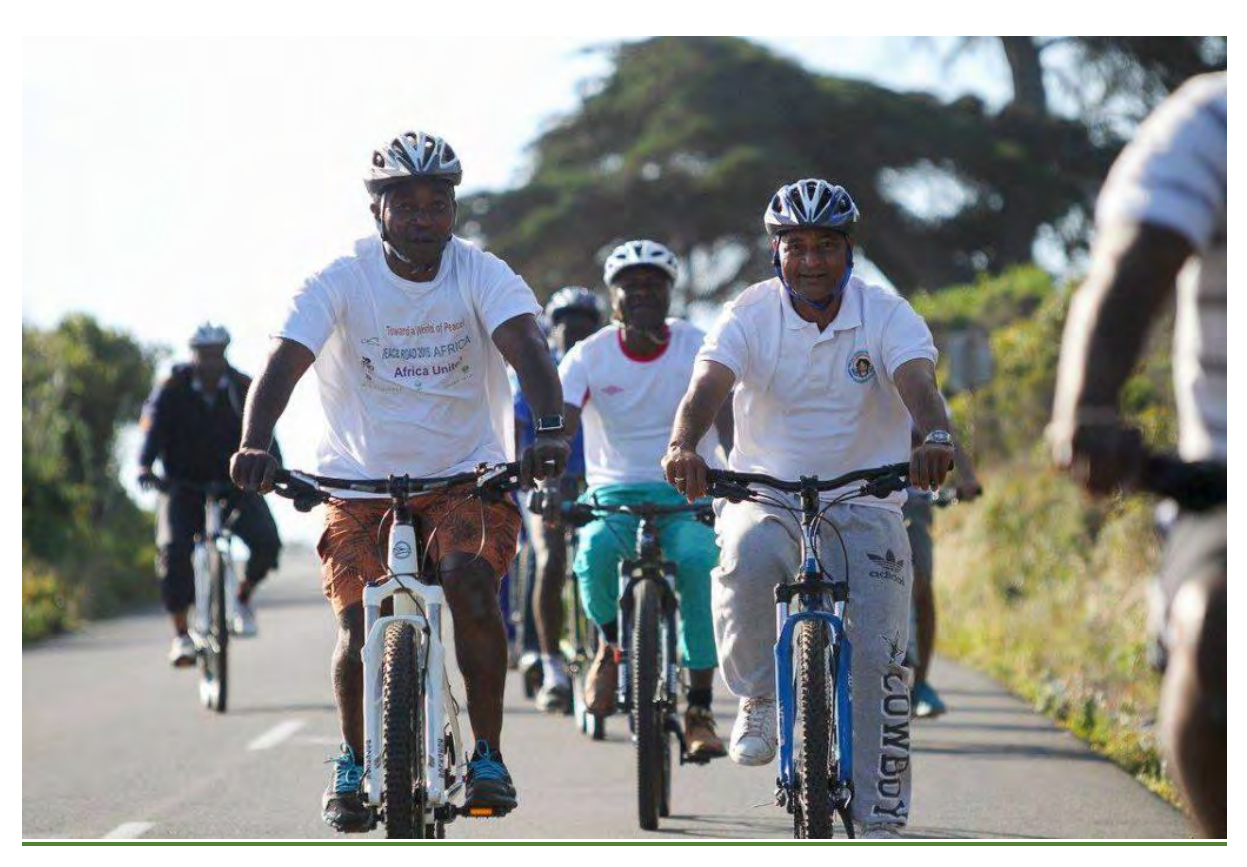
Peace Road 2016 in South Africa (November 9, 2016)