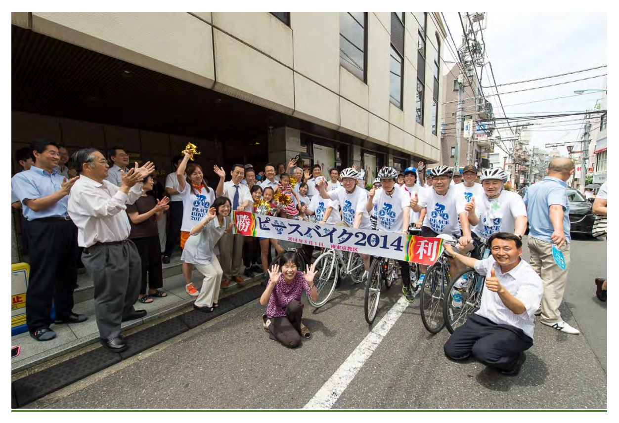
Peace Road 2014 in Japan (August 1, 2014)