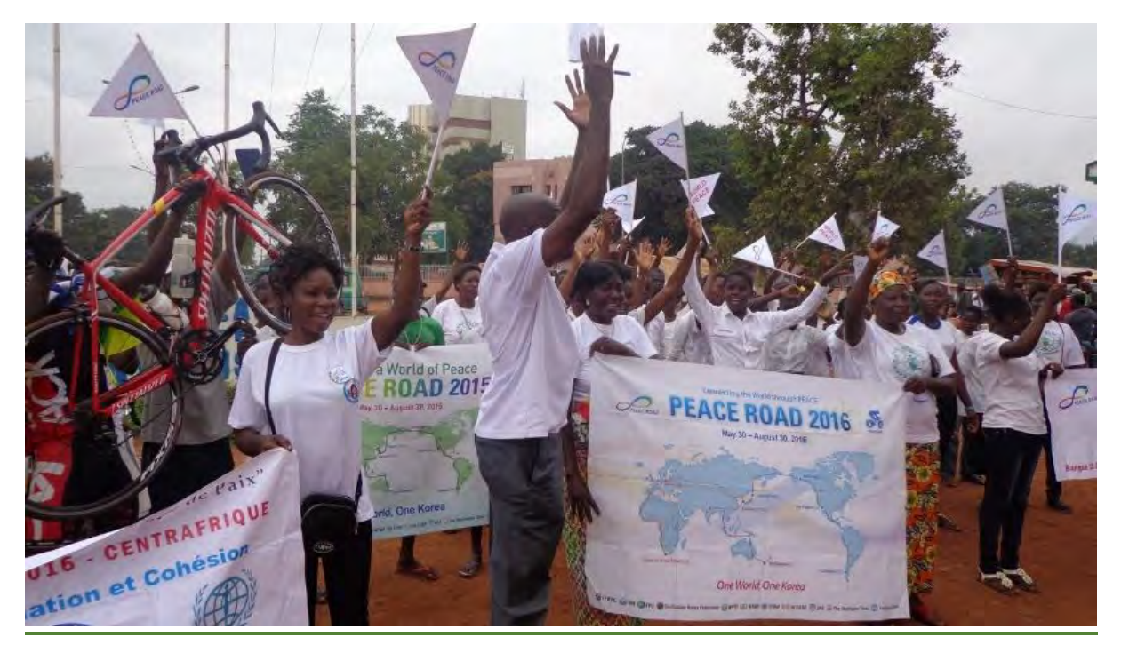
Peace Road 2016 in Central African Republic (July 23, 2016)