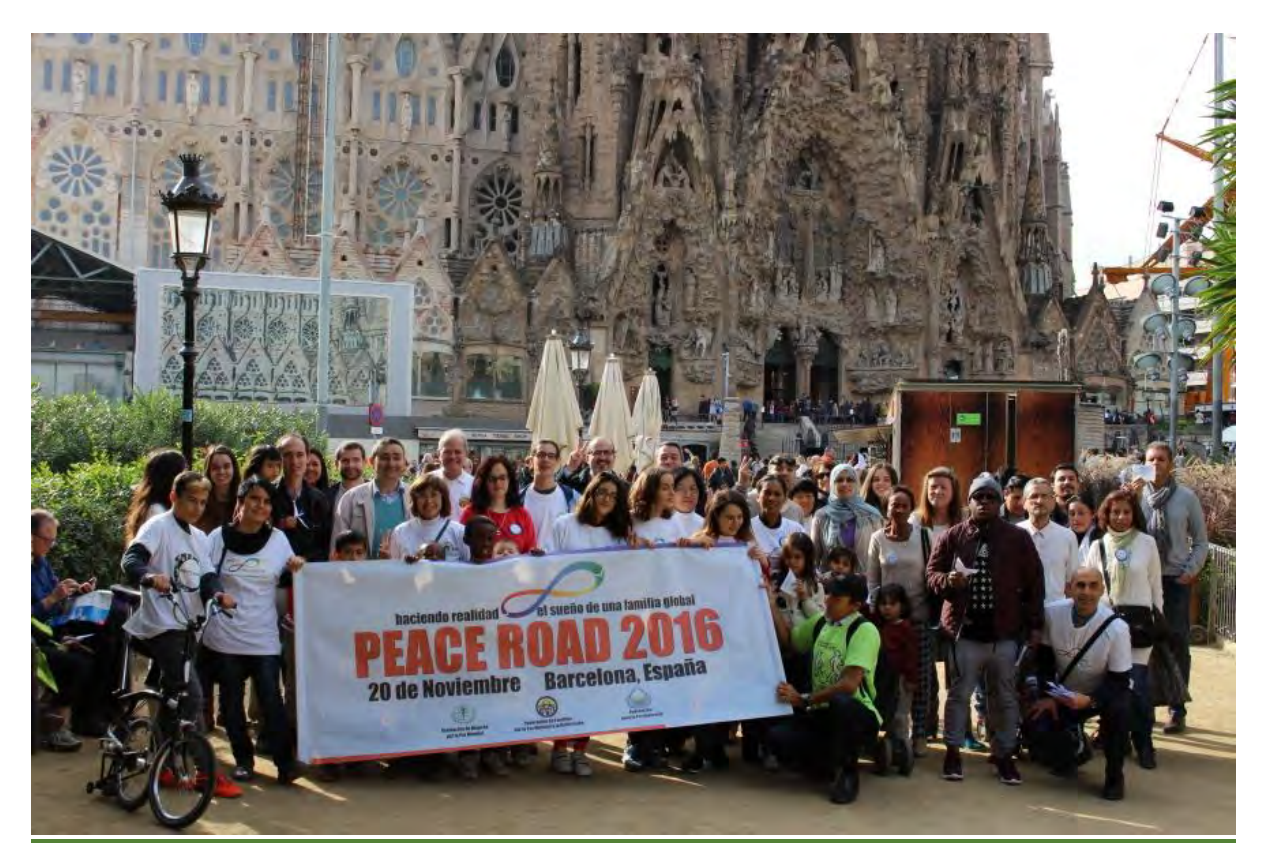
Peace Road 2016 in Spain (November 20, 2016)