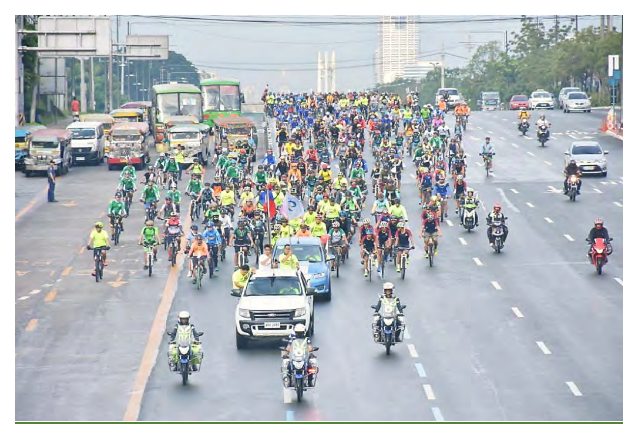
Peace Road 2016 in Philippines (August.7, 2016)