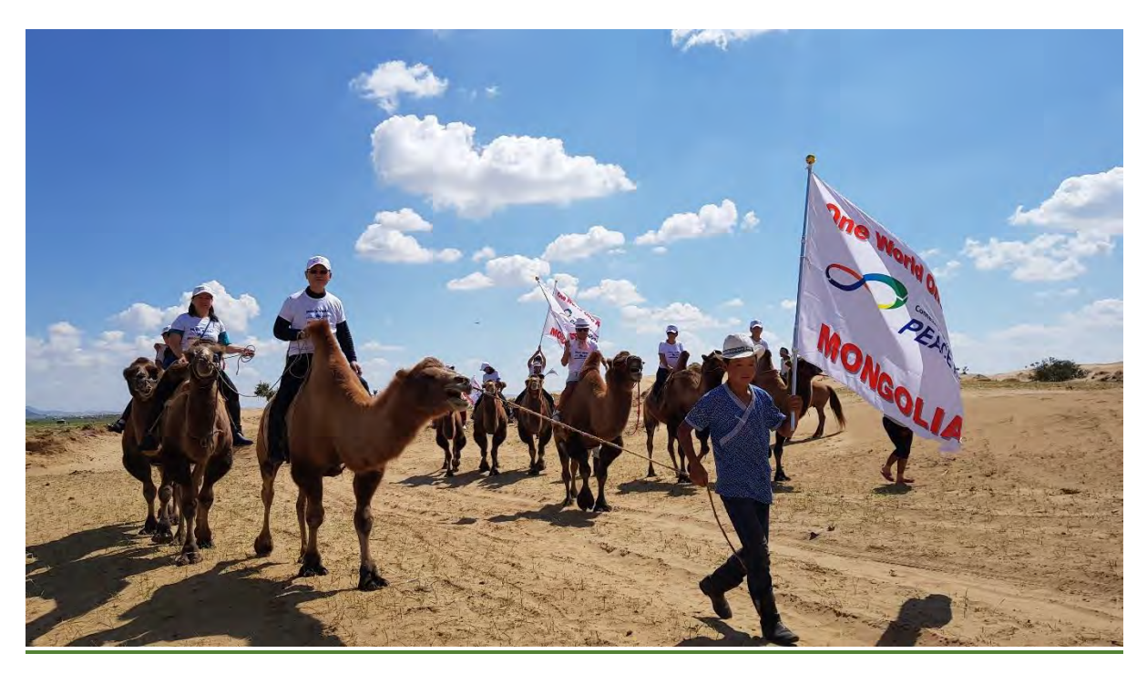
Peace Road 2017 in Mongolia (September 8, 2017)