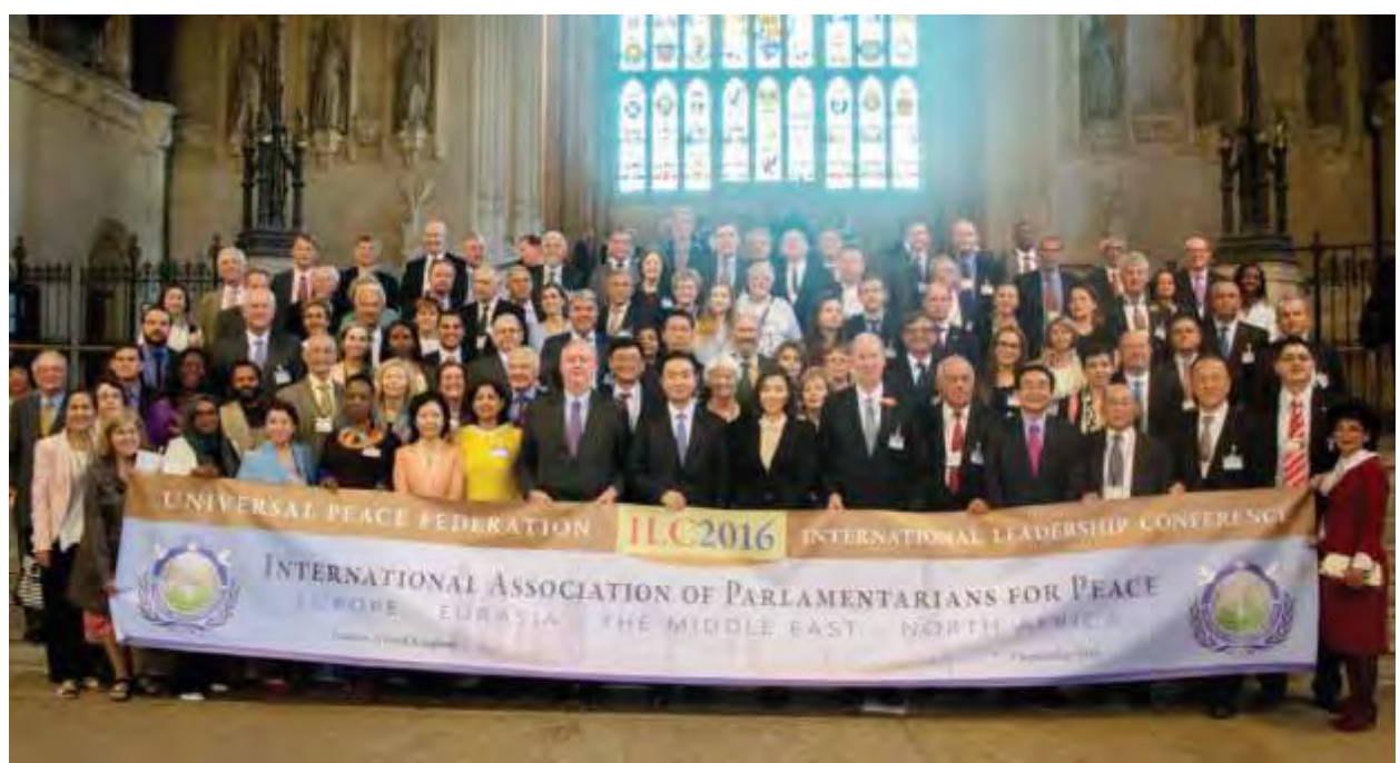
IAPP participants in the Palace of Westminster, the British Parliament

1990 was pivotal in True Parents' providence. The World Media Association and the Summit Council were instruments for True Parents to go to Moscow in the Spring of 1990 and meet President Gorbachev. Their vision had been to "march on Moscow," like having the Washington Monument rally in Moscow. The relationship with President Gorbachev, I think, was providentially important.