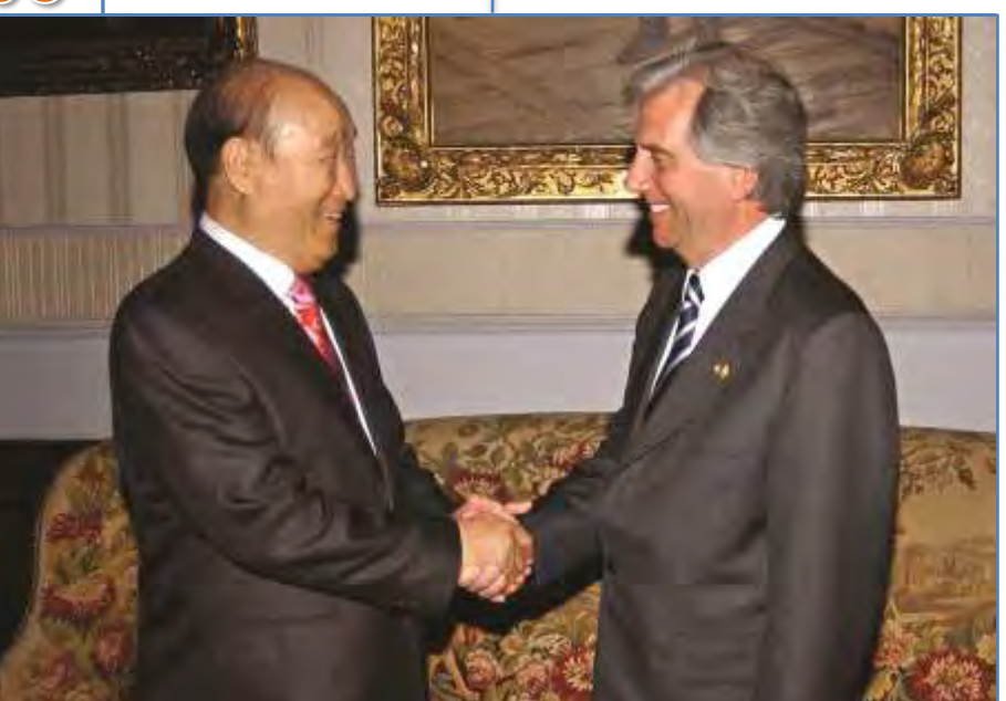
UPF Founders World Peace Tour: 100 Cities in 100 Days October to December 2005