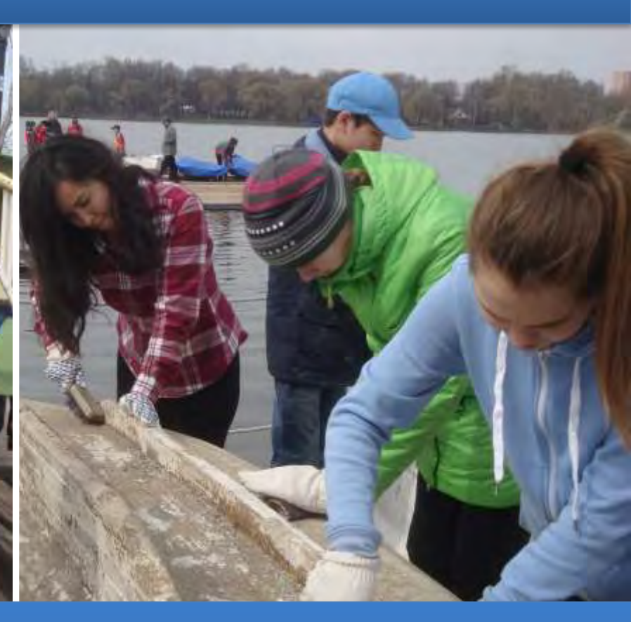
European Youth Join Russian Week of Volunteerism