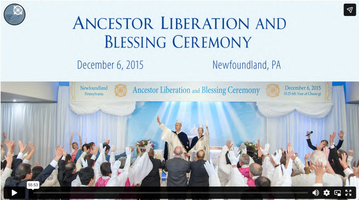
Ancestor Liberation and Blessing - Dec. 6, 2015 - Sanctuary Church Newfoundland PA from Unification Sanctuary on Vimeo.