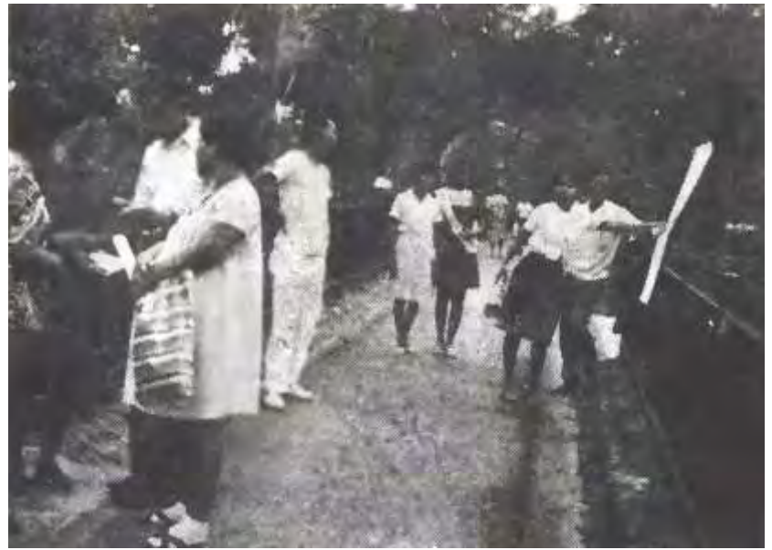
Witnessing and lecturing to passersby