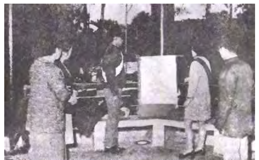
Giving Divine Principle Lecture in a pavilion on a rainy day