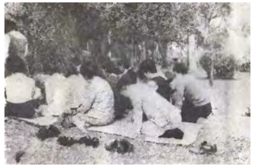
Praying at the Holy Ground in Taipei