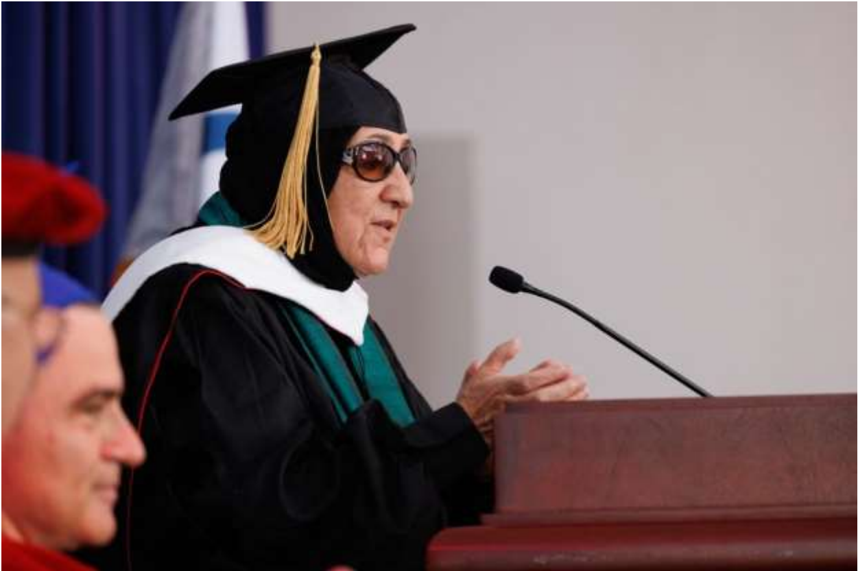
Dr. Sakena Yacoobi

“It is you that is going to make this world a beautiful place. It is you that is going to transform lives. It is you that is going to bring peace...Let me tell you, peace is something that we can all bring together collectively. As an individual, no one can bring peace. We can bring peace in a nation, and in the world, just if we all work together side by side.”