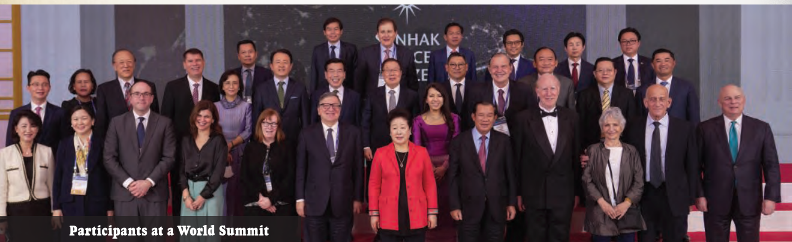
Participants at a World Summit

The World Summit program introduces essential, universal values, principles and practices that are necessary to create a world in which people of every region, race, nationality, culture and religion live together in peace. We consider the root causes of conflict and the ways we can move together from states of conflict, inequality, poverty and enmity toward reconciliation, cooperation and prosperity as one human family under God.