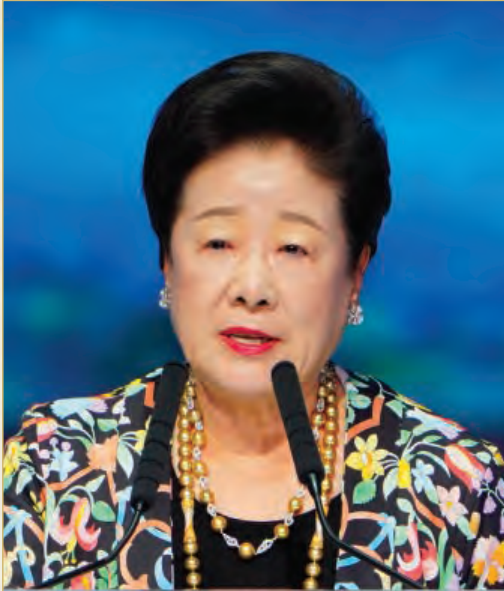
Dr. Hak Ja Han Moon, Founder

WORLD SUMMIT PROGRAMS HAVE BEEN HELD THROUGHOUT THE WORLD, BRINGING TOGETHER THOUSANDS OF LEADERS FROM ALL WALKS OF LIFE