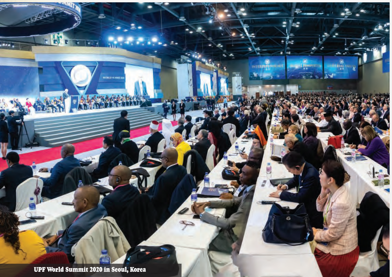
UPF World Summit 2020 in Seoul, Korea

UPF is an NGO in General Consultative Status with the Economic and Social Council of the United Nations. We support and promote the work of the United Nations and the achievement of the Sustainable Development Goals.