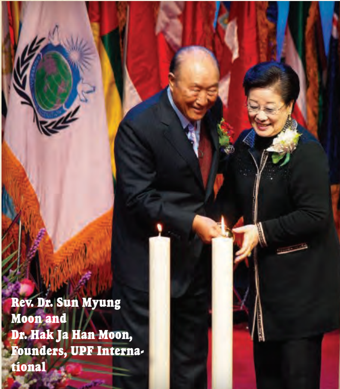
Rev. Dr. Sun Myung Moon and Dr. Hak Ja Han Moon, Founders, UPF International

The Universal Peace Federation (UPF) is a global network of individuals and organizations dedicated to building a world of peace centered on universal spiritual and moral values. UPF and its global network of Ambassadors for Peace bring universal, and reconciling the divided human family.