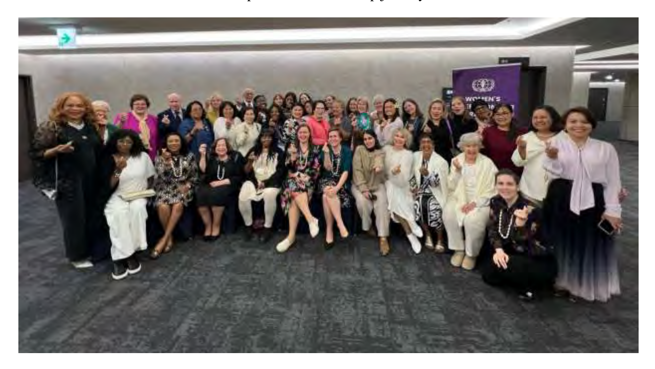
DMZ: A Symbol of Transformation

In April 2025, 43 women from across the United States joined WFWP USA on a pilgrimage to Korea to commemorate the opening of the first International Interfaith Temple and honor the 33<sup>rd</sup> Anniversary of the Women's Federation for World Peace. Among them were close partners and distinguished guests - women leaders from diverse backgrounds who have been walking with us in our shared mission for peace. Each woman covered her own program and travel costs, motivated by the belief that this would be a transformational investment in their spiritual and leadership journeys.