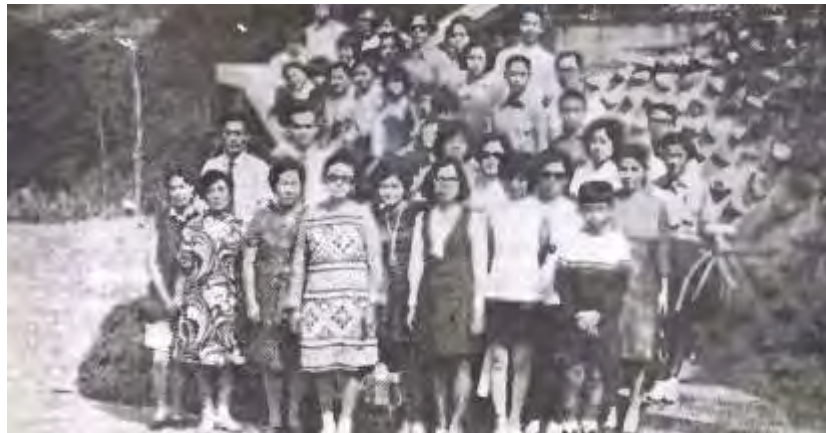
Chinese Family poses in a park in Taipei