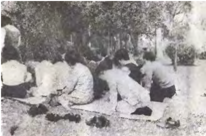
Praying at the Holy Ground in Taipei