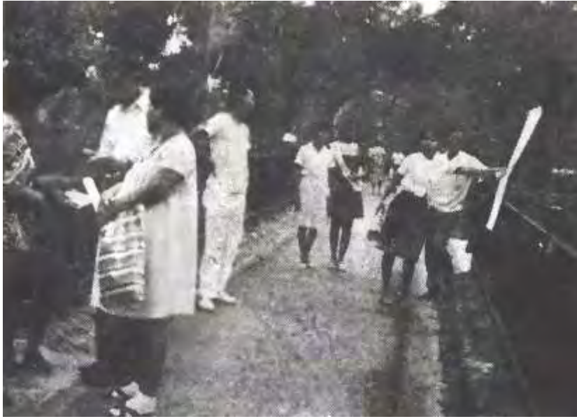
Witnessing and lecturing to passersby