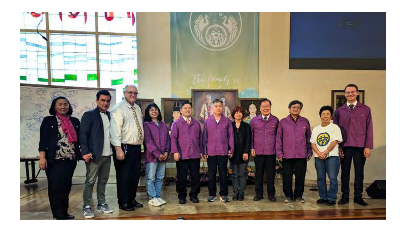
Fish Business Leaders Meet in Las Vegas!