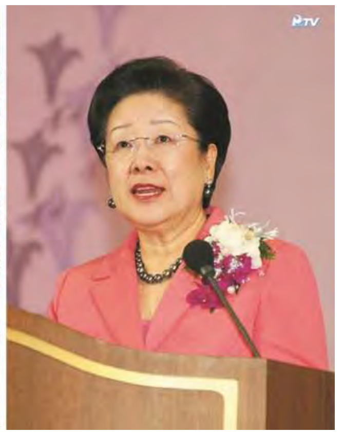
Establishment of the Washington Times (May 17, 1982, Washington D.C.)

The Washington Times, a daily newspaper, was founded with the publication of its first issue on May 17, 1982. Publishing tens of thousands of morning papers and having a headquarters located in Washington D.C., the Washington Times became the second largest newspaper in Washington D.C. after the Washington Post. True Father spoke of the significance behind the establishment of the Washington Times saying that he began a newspaper, a business even affluent people were giving up on, to save the United States and what was then known as the Free World. This year, the Washington Times celebrates