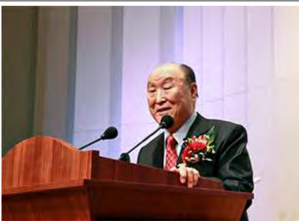
True Father at the opening of the Cheon Bok Gung

True Parents dedicated the Cheon Bok Gung, or “Unification Peace Temple,” on February 21, 2010. In 2008, True Father had called for the establishment of a 20,000-member church in Seoul that would serve as a platform to influence the nation. He later increased the goal to a 210,000-person congregation that would influence Korea and eventually the world, not just socially and culturally but also spiritually. Efforts to construct a “growth-stage” Cheon Bok Gung began in earnest with the acquisition of a large public building in Seoul’s Yongsan district. The church’s worldwide membership, led by Japan and Korea, donated nearly $100 million for the purchase and subsequent renovation costs. This was completed in early 2010, and Unificationists undertook an hour-long march from the previous church headquarters to the new sanctuary, which also would serve as International and Korean Church headquarters.