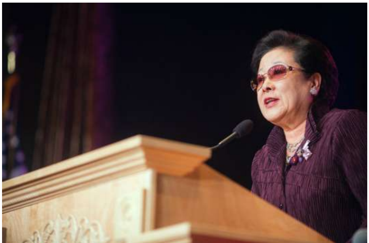
True Mother Addresses 1,200 attendees at the WFWP USA 20th Anniversary Convention. Sun Jin Moon, our current Director General for Family Federation for World Peace and Unification (FFWPU) International, delivered True Mother's keynote address, "Women as the Turning Point for Peace."

October 27, 2012 True Mother Addresses WFWP USA 20th Anniversary Convention