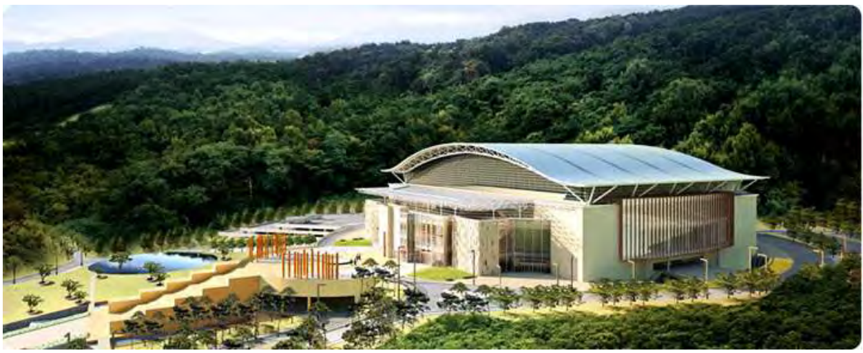
Cheongshim Peace World Center under Construction.

Three thousand people attended the groundbreaking ceremonies for the Cheongshim Peace World Center on October 28, 2008. Designed to hold 25,000 people, it was created to be the largest and most sophisticated multipurpose cultural center in South Korea, eight times larger than the Sejong Center for the Performing Arts and twice as large as the Olympic Gymnastics Hall, both located in Seoul. With three floors underground and four floors above, it was designed to be the first Korean arena with folding chairs, a state-of-the-art moving stage and an audiovisual system to host an array of events including concerts, business conventions, corporate events, indoor sports competitions, educational events, expositions and