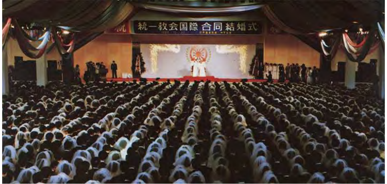
The 6,500 Couple's Holy Marriage Blessing Ceremony, October 30, 1988.

6,500 Couple's Holy Marriage Blessing Unites Korean and Japanese in Marriage