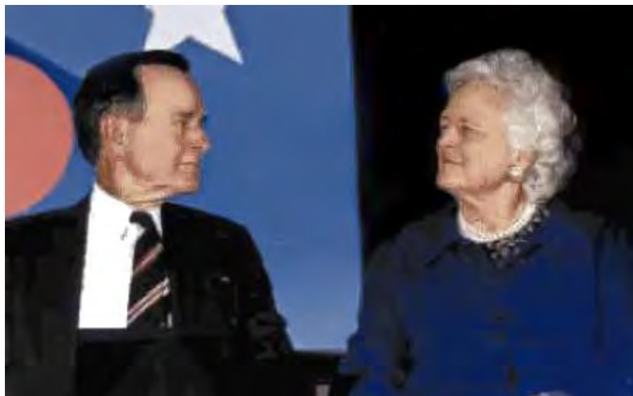
Former U.S. President and First Lady George and Barbara Bush attend a WFWP conference.

True Mother Tours Japan with President and Mrs. George H.W. Bush