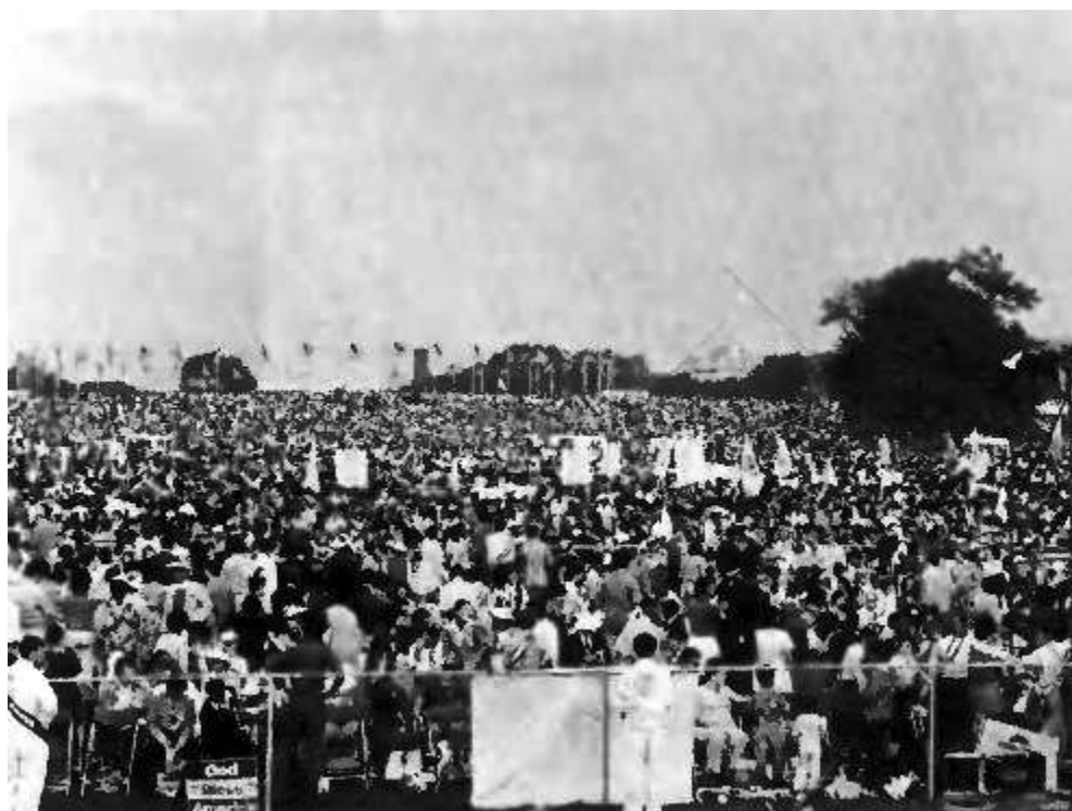
Crowds gather at the Washington Monument when True Father speaks in 1976.

True Father spoke before 300,000 people at the Washington Monument rally, which was the second of two major rallies held in 1976 to celebrate the United States' bicentennial. The first had been the Yankee Stadium rally on June 1 in New York City. They were both part of the "Bicentennial God Bless America Festival," which True Father stated was unique among the bicentennial observances because they were convened in the name of God and included international participants. At Washington Monument, True Father spoke on "America and God's Will." He stated, "The United States of America, transcending race and nationality, is already a model of the unified world." He also said that Judaism, Christianity and the Unification Church are sibling faiths and that Israel, the United States and Korea as sibling nations had "a common destiny representing God's side" and needed "to restore the United Nations to its original purpose and function." He called upon the three religions and nations to "join hands in a unified effort," contributing "internally to the unification of world religions and externally to the unification of the world itself."