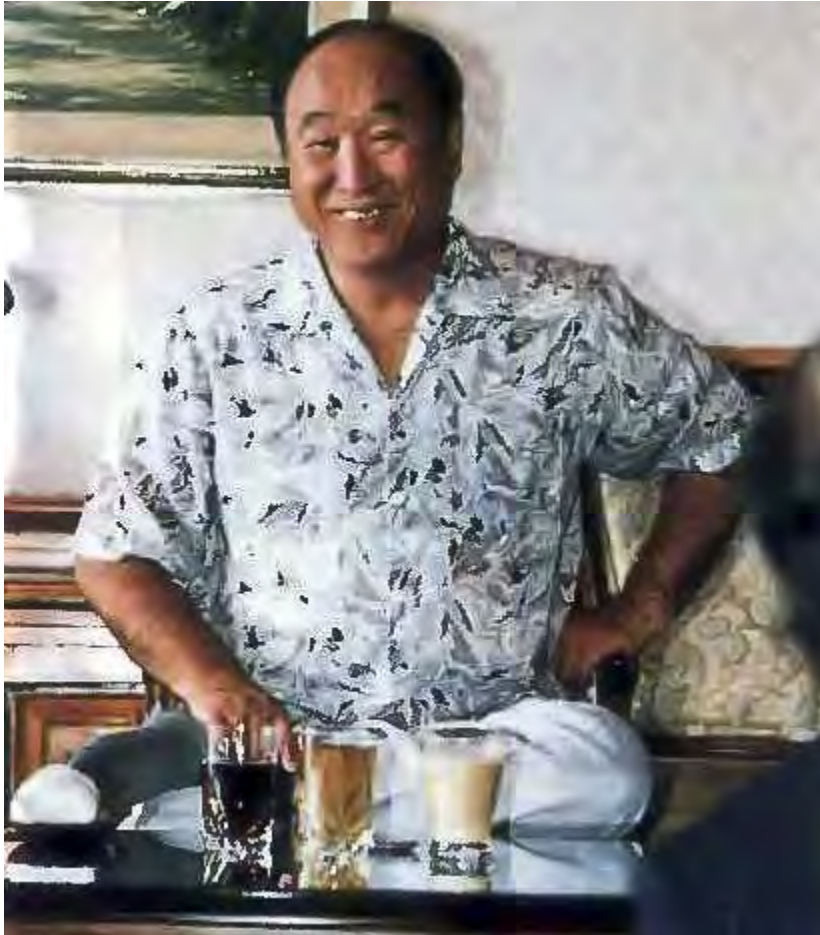
True Father welcomes the representatives of 120 nations to his home in Korea for the Seoul Olympics.

The Games of the XXIV Olympiad took place from September 17 to October 2, 1988, in Seoul. The “Seoul Olympics” were significant not only for Korea as the second Asian nation to host the Olympic Games but also for the world, as the games brought together athletes from the communist and free-world nations for the first time since 1976. These also were the last Olympic Games for the Soviet Union and East Germany, both of which would cease to exist by the time of the next Olympic Games in 1992. True Father recognized this and made a special effort to welcome Eastern Bloc and Soviet athletes, providing them with generous gifts and invitations to cultural events. Although Coca-Cola was the official soft drink of the Games, athletes, friends and officials of many nations accepted more than 40,000 cans of McCol and bottles of Ginseng-Up. Following completion of the games, True Father proposed the holding of a World Festival of Culture (later designated as the World Culture and Sports Festival) as an “internal” complement to the Olympic Games.