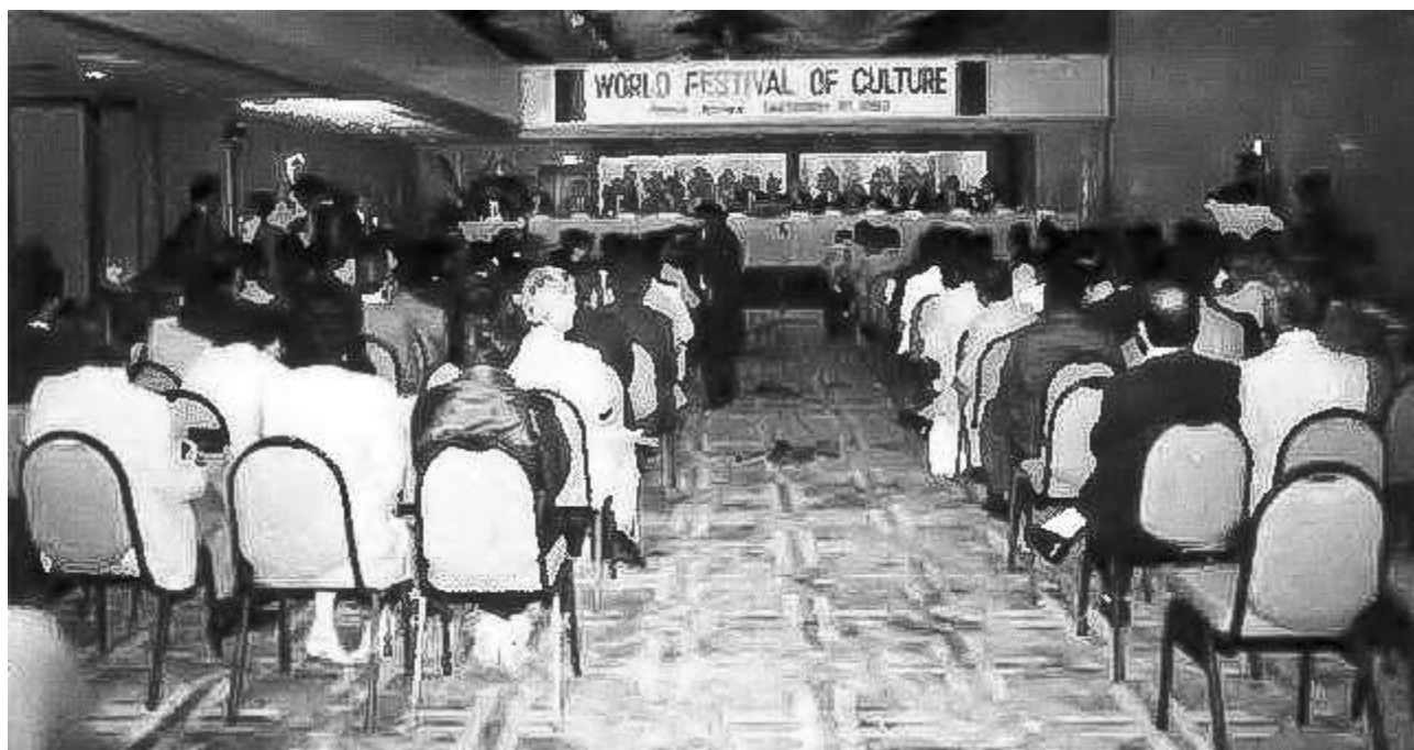
The press conference announcing the World Festival of Culture.

On September 14, 1999, True Father opened the era in which blessed families were no longer to pray in the name of True Parents or any mediator but in their own names as blessed couples who have inherited True Parents' realm of victory. True Father explained that this was meant to mark the era of "personal responsibility." He said that couples should "report their work" and that it was no longer "a time to pray to receive blessings." This guidance was consistent with True Father's view that humankind had entered the Completed Testament Age.