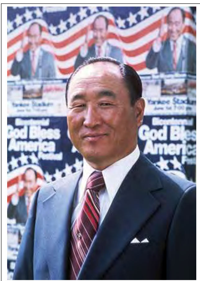
True Father posing for the cover of Newsweek magazine's June 14, 1976, international edition

True Father granted an interview to Newsweek International's executive and general editors. Excerpts from their three-hour conversation were published as part of a cover story on the Unification Church. [www.tparents.org/Moon-Talks/SunMyungMoon76/SunMyungMoon-760614.htm]