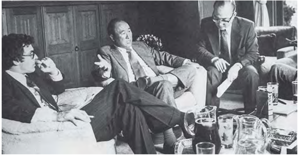
True Father being interviewed for the Newsweek magazine article