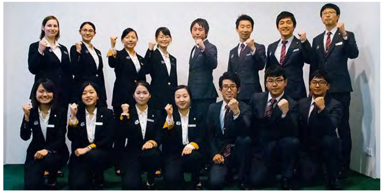
UPA students take a group photo at the finale of their closing ceremony

The Universal Peace Academy's (UPA) United States Heritage Tour culminated with a graduation ceremony for the 16 cadets on February 5, 2014 at the Learning Center on 43rd Street, NY. Along with testimonies and speeches, the participants viewed a slide presentation which highlighted their tour across the country from churches to national parks.