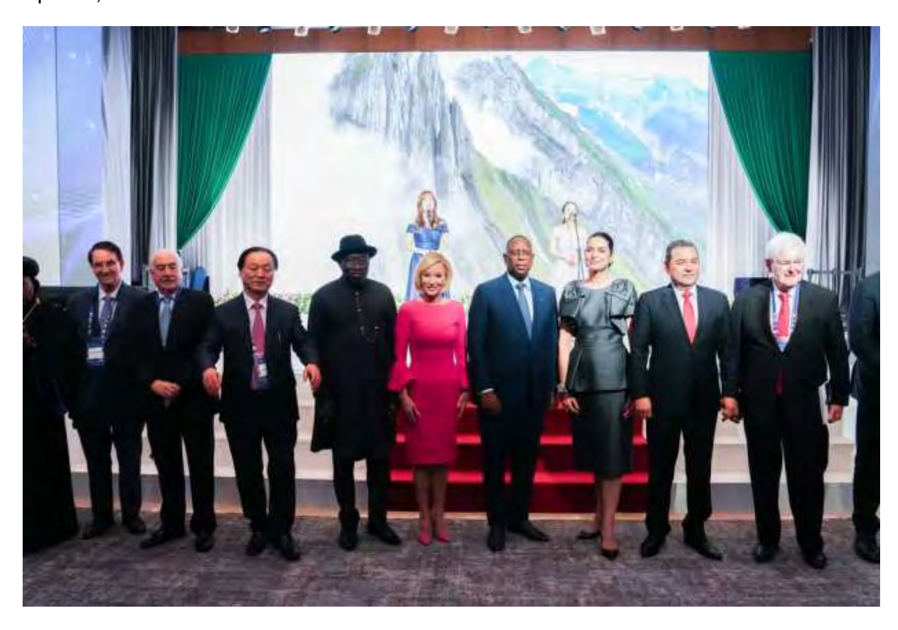
Seoul, South Korea – World Summit 2025 opened at the Lotte World Hotel in Seoul on April 11, bringing together political and religious leaders, along with experts from various other fields, from 117 nations, to explore paths to global peace.