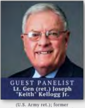
(U.S. Army ret.); former Executive Director, Nationa Security Council