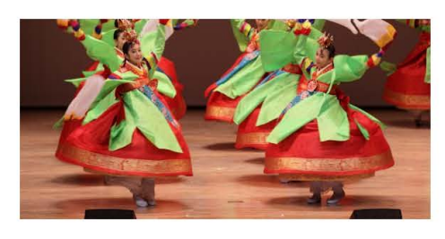
Entertainment by the world renowned Little Angels of Korea and more!