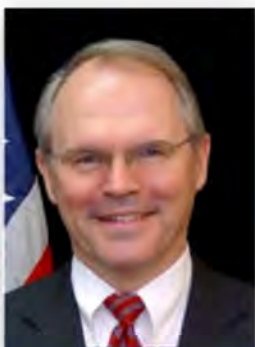
Amb. Christopher Hill

Featuring guest panelist Amb. Robert R. King