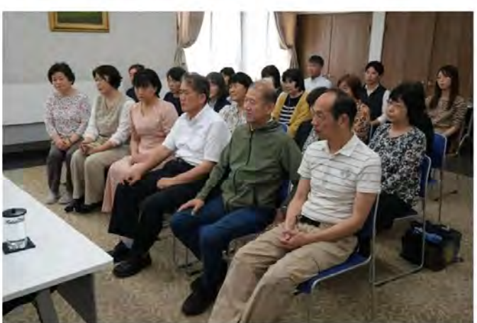
Believers of the Koriyama Church speak about their feelings toward the church they built, amid the non-contentious lawsuit for the dissolution order of the Family Federation.

"Even if a religious corporation is dissolved by a dissolution order, believers are not prevented from continuing a religious group without legal status, or from forming a group or corporation anew in an appropriate manner. Nor are they hindered from conducting religious activities or preparing new facilities and items for religious purposes."