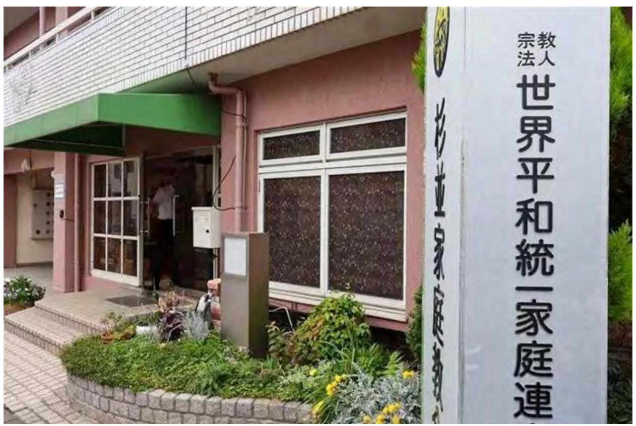
Entrance to the Suginami Church of the Family Federation - Suginami Ward, Tokyo