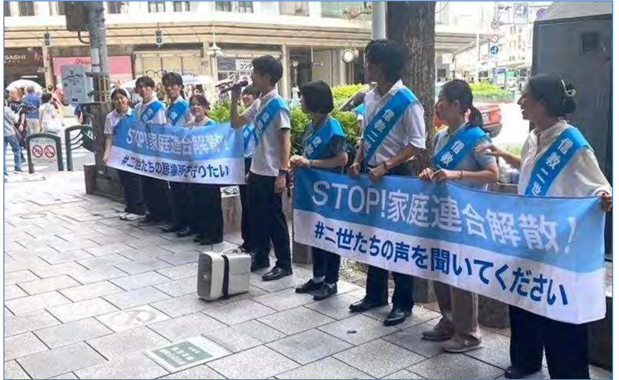
Demonstration by young members of the <u>Family Federation</u> in Kyoto on June 22, 2025, protesting the authorities' attempt to dissolve the <u>religious organization</u> and seize its assets

On a Sunday in mid-June, a youth gathering was held at the Suginami Church. Separate from worship, it was called a Restoration Meeting, a monthly event for young believers. That day, around 15 men and women in their 20s and 30s - working adults - attended. They drove together to a riverside in northern Saitama Prefecture and enjoyed a friendly game of park golf, their laughter echoing across the area.