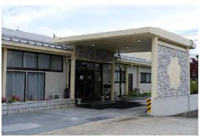
The Family Federation's Koriyama Church.

The legal proceedings regarding the dissolution of the Family Federation for World Peace and Unification (formerly the Unification Church) have moved to Tokyo High Court. If the High Court upholds the dissolution order, liquidation of the organization's assets will begin immediately, even before a ruling from the Supreme Court. If that happens, the church facilities where believers conduct worship and other religious activities may be lost, causing growing concern among the faithful that they will lose their spiritual home.