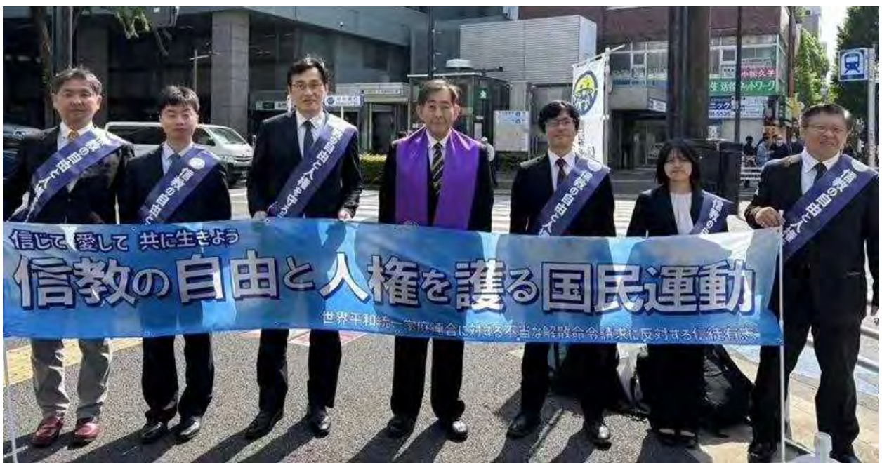
Demonstrators in Suginami, Tokyo May 1, 2025, protesting the dissolution order against the <u>Family</u> <u>Federation</u>