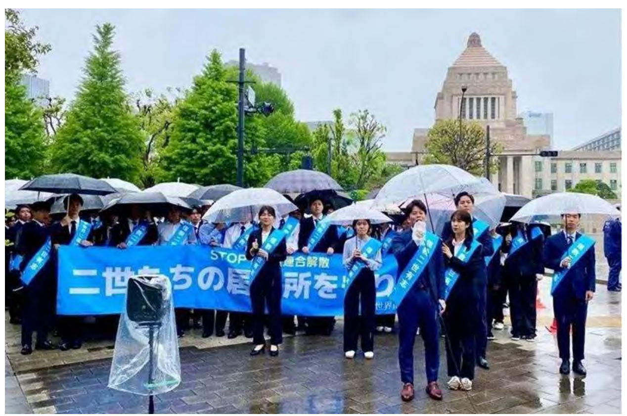
Demonstration by young members of the <u>Family Federation</u> outside the national parliament on May 6, 2025, protesting the authorities' attempt to dissolve the <u>religious organization</u> and seize its assets

However, he expressed concern that "losing the church means losing the opportunity to gather, and the community would vanish."