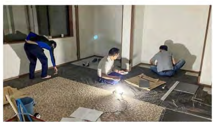
Believers of the Family Federation's Koriyama Church tiling during construction of the new church facility.

"All the believers were filled with joy."