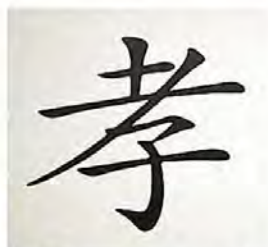
The Chinese character for hyo (filial piety). In the character a son, 子 (Korean ja), carries an old man, 老 (Korean no), on his back.

"If there is an apocalypse and humans have to relocate, they need to take with them the filial piety of the Koreans."