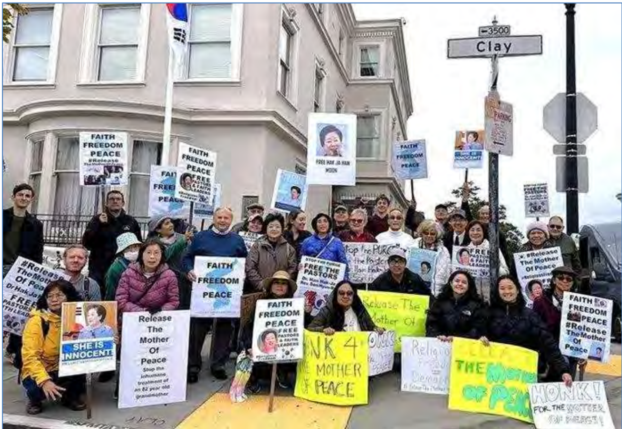
Demonstration in support of Mother Han in front of the South Korean embassy in San Francisco, USA November 2025

Leftwing advocacy group forms strategic alliances and points out treatment of Mother Han as warning against religious persecution and abuse of state power in South Korea and japan