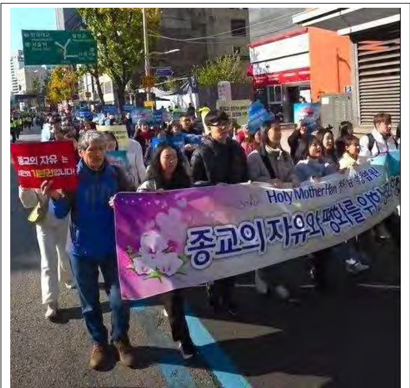
Demonstration near Seoul City Hall Nov. 16, 2025 in support of Holy Mother Han

The emotional intensity of the article is heightened through detailed accounts of Mother Han 's conditions in custody. The emphasis on lack of heating, inadequate ventilation, the absence of a wheelchair or cane, and the requirement to wash a single set of clothes underscores the argument that her treatment amounts to cruel, inhuman, or degrading treatment. These descriptions serve two functions. First, they support the claim that South Korea's actions constitute human-rights violations. Second, they dramatize the stakes of the conflict to mobilize sympathy and solidarity from an international audience.