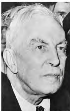
Arnold Joseph Toynbee (1889-1975), English historian, a philosopher of history, an author of numerous books and a research professor of international history at the London School of Economics and King's College London. Best known for his 12-volume A Study of History (1934–1961), where he studied the emergence and decline of 26 civilizations throughout human history and concluded that their success came from effectively meeting challenges under the guidance of creative minorities made up of elite leaders.

The famous British philosopher of history Arnold J. Toynbee (1889-1975) once said that if the Earth were to perish and humanity had to flee into space, the one thing they must take with them is Korea's culture of filial piety. He praised the Korean family system as the most excellent system for humanity and the core ideology of humankind. [See editor's note below]