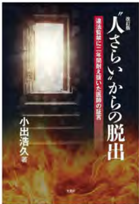
Front cover page of "Escape from Kidnapping" by Hirohisa Koide, published in Japanese 2023 by

But it's not the point. The point is, years later, even 20 years later, they thought they could be abducted and confined again. They still had the pressure.