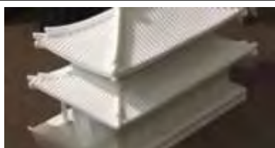
Miniature pagoda sold by members of the Unification Church in Japan

pagodas, seals and other artifacts - believed to bring good luck - that some believers from the Unification Church [See editor's note below] back in the 1980s and early 90's were selling for high prices. And then the lawyers extended the expression "spiritual sales" to donations.