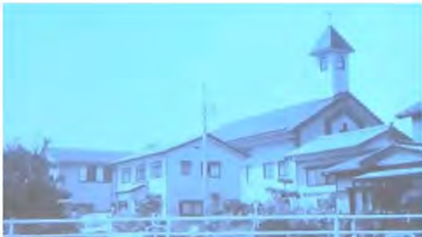
The pastors of the