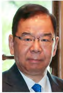
In Nov. 2022 interview, Kazuo Shii, chairman of the Japanese Communist Party (JCP) said the party is fighting the "final war" against the Family Federation / Unification Church. Here Shii on 30th March 2023.

In an interview published on 22 nd November 2022, in the communist newspaper Shimbun Akahata , Kazuo Shii, former chairman of the Japanese Communist Party, was asked: "From the Communist Party's point of view, is this the final war against the Family Federation ?" He responded affirmatively, stating that the struggle had been ongoing since at least a gubernatorial election in 1978.