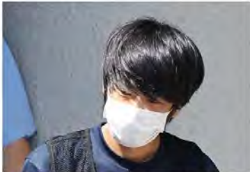
Tetsuya Yamagami, the man who killed Shinzo Abe, the former prime minister of Japan.

The specifics of his family background raise several questions, and his deeper motives remain unclear. Reports suggest he held communist sympathies and spoke of initiating a revolution. Incredibly, a member of the Japanese Red Army even produced a film about him, portraying him as a hero; the film was shown in Japanese cinemas.