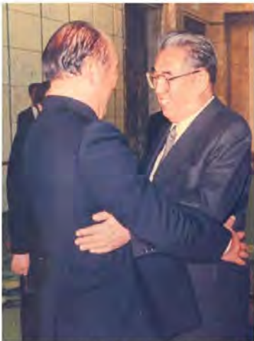
Sun Myung Moon and Kim Il-sung 6th Dec. 1991

No one would have imagined the successful Trump meetings way back 30 years ago. In 1991, Reverend Moon first met with Kim Il-sung, then the North Korean president, to discuss ways to achieve a peace on the Korean Peninsula, as well as on international relations and tourism. In 1992, Kim Il-sung gave his first and only interview with the Western news media to The Washington Times reporter Josette Sheeran.