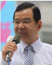
Kazuo Shii.

Speaker Newt Gingrich has pointed out in a Washington Times op-ed that the chairman of the Japanese Communist Party has revealed their plan in an interview. Communist Party chairman Shii said openly that the starting point in the history of this, was an anti-communist organization that was united with the Unification Church . They called this half a century of historical collusion between the two organizations.