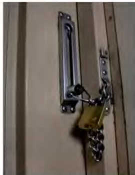
Locked up to have your faith broken: The door was always chained.

"Stay in constant communication with the persuaders (説得者)." This shows that it's not just the family involved.