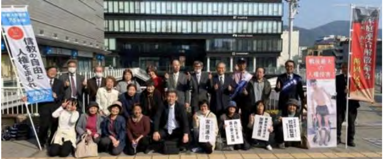
More out protesting the dehumanizing state persecution of the Family Federation , here from a protest in Kitakyushu, Japan March 23, 2025