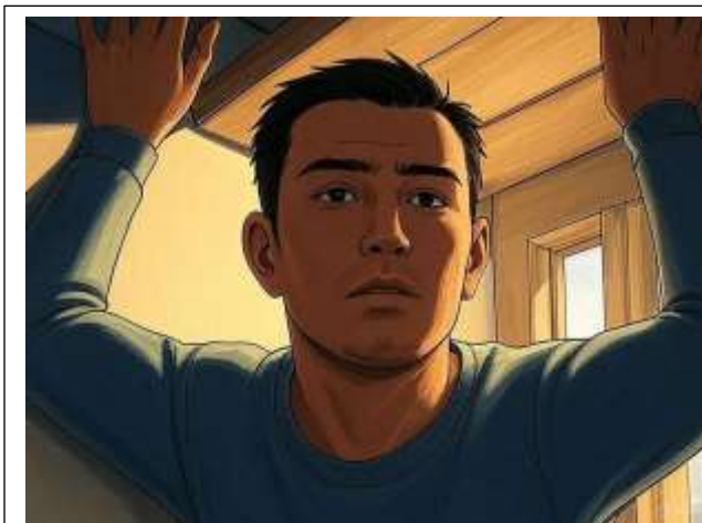
Removing ceiling panels in order to escape in May 2025

"First, nail the long wooden slats on both sides of the column. Try not to damage the apartment structure too much, but some damage is inevitable. If using acrylic sheets, line them up as needed and secure them with screws from behind. Use an electric drill to fix them in place."