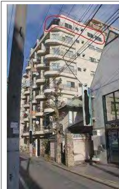
Property for confinement: The location of the 8th floor apartment in Ogikubo, Tokyo where Toru Goto was held captive and dehumanized

The book also refers to this process as "protection", but its true nature is clear: