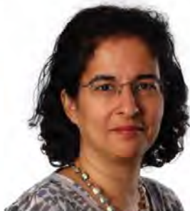
Sent formal UN request to Japan, but no reply: Nazila Ghanea, UN Rapporteur on Religious Freedom since February 2023. Photo: GiovannaKa / Wikimedia Commons. License: CC BY-SA 4.0 Int

By this act, the Japanese government has shamefully abandoned the core principles of human rights and religious liberty enshrined in the United Nations conventions that Japan itself has signed and committed to uphold. It now aligns itself with pariah states that routinely deny their citizens the