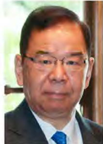
Declared the ‘final war’ against the Unification Church : Kazuo Shii, here 30th March 2023.

“This is the final war against the Unification Church .” – Kazuo Shii, Chairman, Japanese Communist Party.