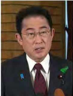
Prime Minister Fumio Kishida swayed by communist campaign. Here, 16th April 2023.

For the first time in Japan's postwar history, a peaceful religious organization is being dismantled by the state without a single criminal conviction. The court's decision does not mark justice – it marks a turning point in Japan's democratic identity.