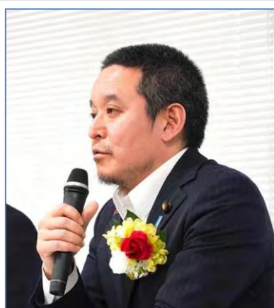
Senator Satoshi Hamada, member of House of Councillors, NHK Party, asking questions in parliament about evidence tampering. Here speaking in Yokohama City, Japan on January 26, 2025

Agency for Cultural Affairs merely repeats that it "cannot comment on matters pending in court." These parliamentarians emphasized that "it is significant that allegations of manipulation or fabrication have not been denied" and demanded relevant documentation - which the Agency for Cultural Affairs refused to provide. If these allegations prove true, it will constitute a serious challenge to Japan's constitutional and legal order. The international community, as well as numerous just and reasonable Japanese politicians and leaders, will not tolerate such injustice.