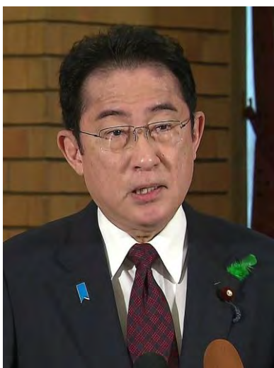
Prime Minister Fumio Kishida, the very person who reversed his position, opening the door wide for a dissolution order, April 16, 2023

When considering these facts comprehensively, it is evident that the Japanese Family Federation not only fails to merit a corporate dissolution order , but also that certain politicians and bureaucrats have targeted it for state-sponsored persecution. This constitutes a serious human rights violation contrary to international law and constitutional principles. The United Nations has raised concerns and made recommendations to the Japanese government on three occasions, stating that religious freedom should not be infringed upon under the pretext of "public welfare". The Japanese government ignored these , however, and proceeded with the decision. This represents a serious betrayal of the United Nations and the international community.