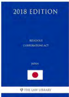
Front page of 2018 English version of Religious Corporations Act of Japan.

This is a prime example of politically unacceptable populism.