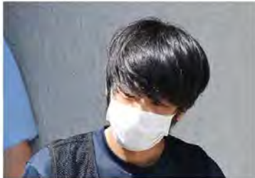
Grudge of terrorist sensationalized by media: Tetsuya Yamagami, the man who killed Shinzo Abe, the former prime minister of Japan.

Specifically, regarding the Family Federation , it has not committed any criminal offenses. When former Prime Minister Shinzo Abe (安倍 晋三, 1954–2022) was assassinated, and the Unification Church issue came under scrutiny, then-Prime Minister Fumio Kishida (岸田 文雄) made an erroneous decision. Abe’s assassination should have been recognized as an act of terrorism , and the focus should have been on investigating the crime itself. However, when the suspect’s supposed grudge against the former Unification Church was sensationalized by the media, Kishida, in response to media pressure, expanded the criteria for dissolution to include civil cases as grounds for dissolution.