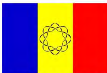
The Soka Gakkai International flag. Photo: QueerMichael / Wikimedia Commons. License: CC ASA 4.0 Int

[ Editor's note 1: A non-contentious case refers to a legal matter where there is no dispute between parties. These cases typically involve administrative, procedural, or uncontested legal actions, such as probate (handling a deceased person's estate) , uncontested divorces , adoption , or registering a trademark . Since there are no opposing parties or legal conflicts, these cases usually proceed smoothly through the legal system without litigation.]