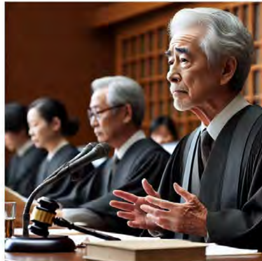
Japanese judges issuing verdict. Illustration: Microsoft Designer Image Creator, 6th January 2025

That being said, if the Tokyo District Court were to issue a decision for dissolution, and a dissolution order is issued, it would be possible to appeal to the Tokyo High Court . However, rather than doing so, it would be possible to file an administrative lawsuit with the Tokyo District Court , arguing