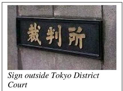
Sign outside Tokyo District Court

Thus, dissolving a religious organization through such a process must be deemed unconstitutional.