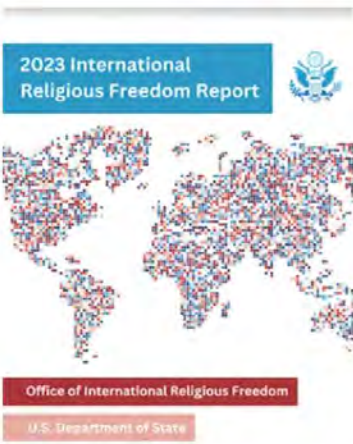
Front cover of U.S. Department of State's 2023 Report on International Religious Freedom, published 26th June 2024.

If a religious organization is dissolved, its clergy would lose their positions, and assets, including places of worship, could be lost, potentially depriving believers of their places of worship. According to official statements from the Family Federation , the organization has approximately 560,000 followers, raising concerns about the impact on religious freedom.