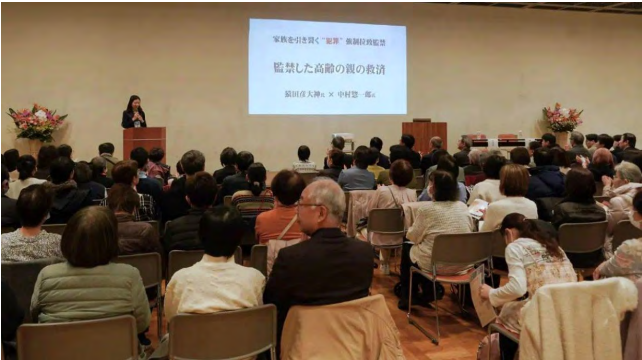
The symposium venue was packed with attendees - March 2, 2025, Kita Ward, Tokyo