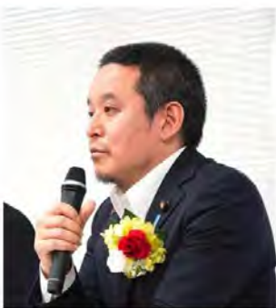
Senator Satoshi Hamada (浜田 聡, House of Councillors, NHK Party) here speaking in Yokohama City, Japan on 26th January 2025.

State Department and other sources criticizing a dissolution order. The government's response was made public in reply to a formal inquiry submitted on 7th February by Satoshi Hamada (浜田聡参), a member of the House of Councillors from the NHK Party.