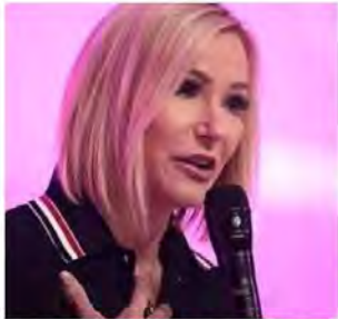
Rev. Paula White, here 11th June 2021 in Grapevine, Texas.

a written response regarding the opposition expressed by Paula White, religious advisor to President Trump, against the Japanese government's request for a dissolution order against the Family Federation for World Peace and Unification (formerly known as the Unification Church ).