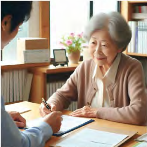
Elderly Japanese woman getting a memorandum at at notary office.

Q: Some elderly Family Federation believers have written memorandums affirming that they do not seek a refund of their donations. Among their children, some are believers while others oppose the faith. In one lawsuit seeking a refund filed by those who opposed the faith, the Family Federation won in both the first and second trials, but after the parent's death, the Supreme Court remanded the case to the High Court in July of last year. This case is expected to have repercussions for many religious organizations beyond the Family Federation.