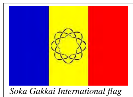
Soka Gakkai International flag

[Editor's note 1: A non-contentious case refers to a legal matter where there is no dispute between parties. These cases typically involve administrative, procedural, or uncontested legal actions, such as probate (handling a deceased person's estate), uncontested divorces, adoption, or registering a trademark. Since there are no opposing parties or legal conflicts, these cases usually proceed smoothly through the legal system without litigation.]