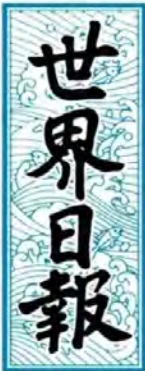
Logo of the Sekai Nippo

Experienced expert on religious corporations' law claims basic principles are set aside in ruling of Japanese Supreme Court against religious minority the Family Federation