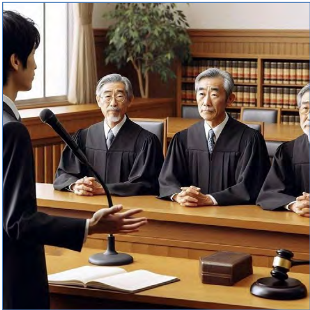
Japanese lawyer presenting a case with legal flaws in court