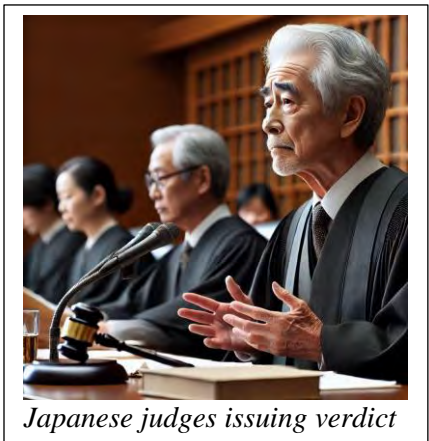
Japanese judges issuing verdict

That being said, if the Tokyo District Court were to issue a decision for dissolution, and a dissolution order is issued, it would be possible to appeal to the Tokyo High Court. However, rather than doing so, it would be possible to file an administrative lawsuit with the Tokyo District Court, arguing that MEXT's request for a dissolution order - the administrative action itself - is unlawful. Under the Constitution, both citizens and private organizations have the right to file an administrative lawsuit against unlawful administrative actions, so this should be a viable option.