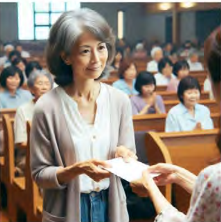
Japanese woman offering a donation at a Sunday worship service.

On 11 th July last year, the Supreme Court ruled that the statement affirming no refund claim was invalid. The case was as follows: