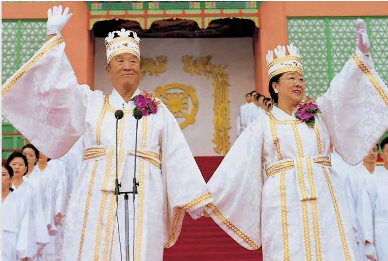
Father Moon and Mother Han Feb. 13, 2000