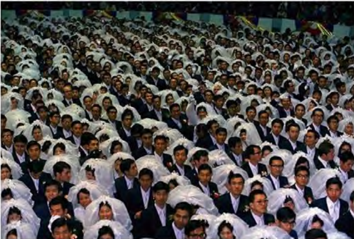
From the Marriage Blessing ceremony of the 1800 couples on 8 th February 1975.

The South Korean Minister of the Board of National Unification gave a congratulatory speech. More than 10,000 guests could watch the event. Straight afterwards, the couples boarded 94 sightseeing buses for a parade through the downtown streets of Seoul.