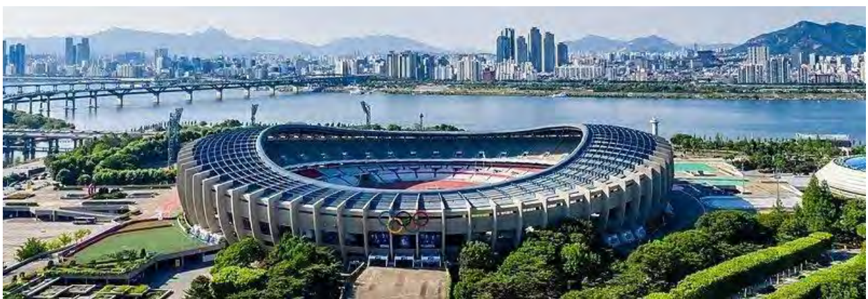
Seoul Olympic Stadium. Photo (2020)

Rather than having a small private wedding for close family and friends, many choose to participate in such a large public ceremony to demonstrate to the world their conviction that their marriage is not just for their own personal satisfaction but that it has a greater and higher significance. Through harmonious and healthy marriages, we can create harmonious families and good societies. World peace ultimately is built on peace in each individual family. All these couples participating in these big wedding ceremonies know that marriage is the key to world peace.