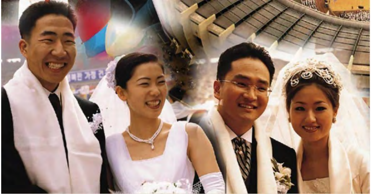
Couples blessed Feb. 13, 2000

The majority of the couples came from South Korea and Japan, but there were also many from Thailand, Taiwan, the USA, Russia, and Europe (over 500 couples from Europe). The event was broadcast via satellite to similar, though smaller, gatherings around the world. At these local events, couples participated who were unable (or could not afford) to travel to Seoul for the main event. In some countries, a video of a previous ceremony with Father Moon and Mother Han was used instead of a satellite connection.