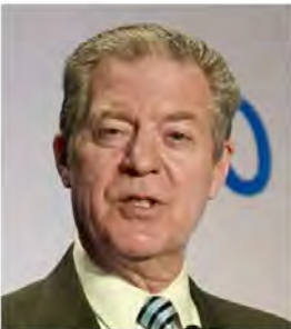
IRF Summit co-chair: Sam Brownback , US ambassador-at-large for

First of all, I want to extend my greetings to