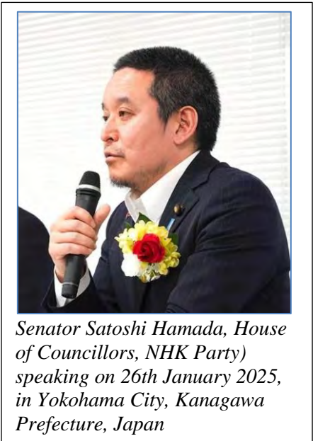
Senator Satoshi Hamada, House of Councillors, NHK Party) speaking on 26th January 2025, in Yokohama City, Kanagawa Prefecture, Japan

Question: Senator Satoshi Hamada (浜田聡) submitted a written inquiry to MEXT requesting fact-checking regarding this newspaper's report, but MEXT did not respond. What do you think about the fact that the proceedings are being conducted in a closed, non-public manner?