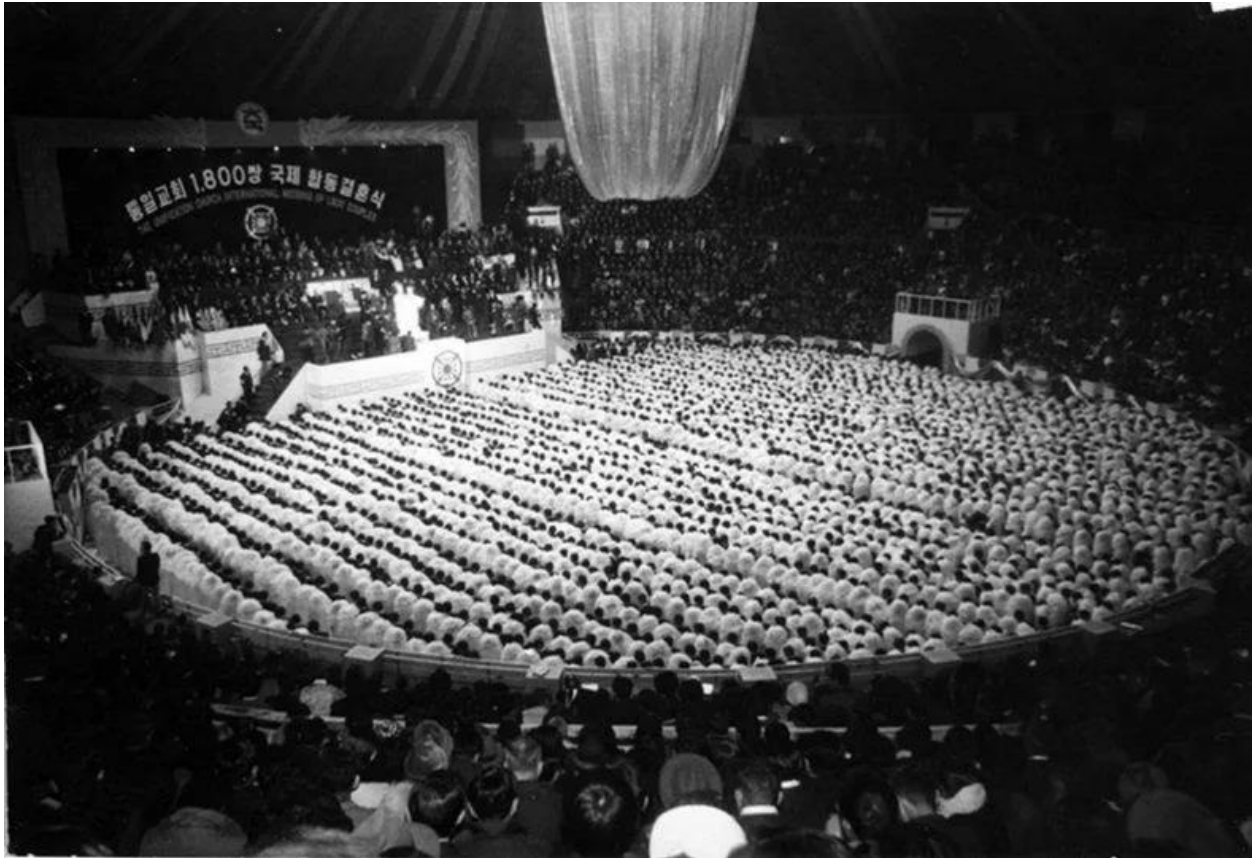
The Marriage Blessing ceremony of the 1800 couples on February 8, 1975

1800 couples blessed in marriage 50 years ago in record-breaking event in indoor arena in Seoul