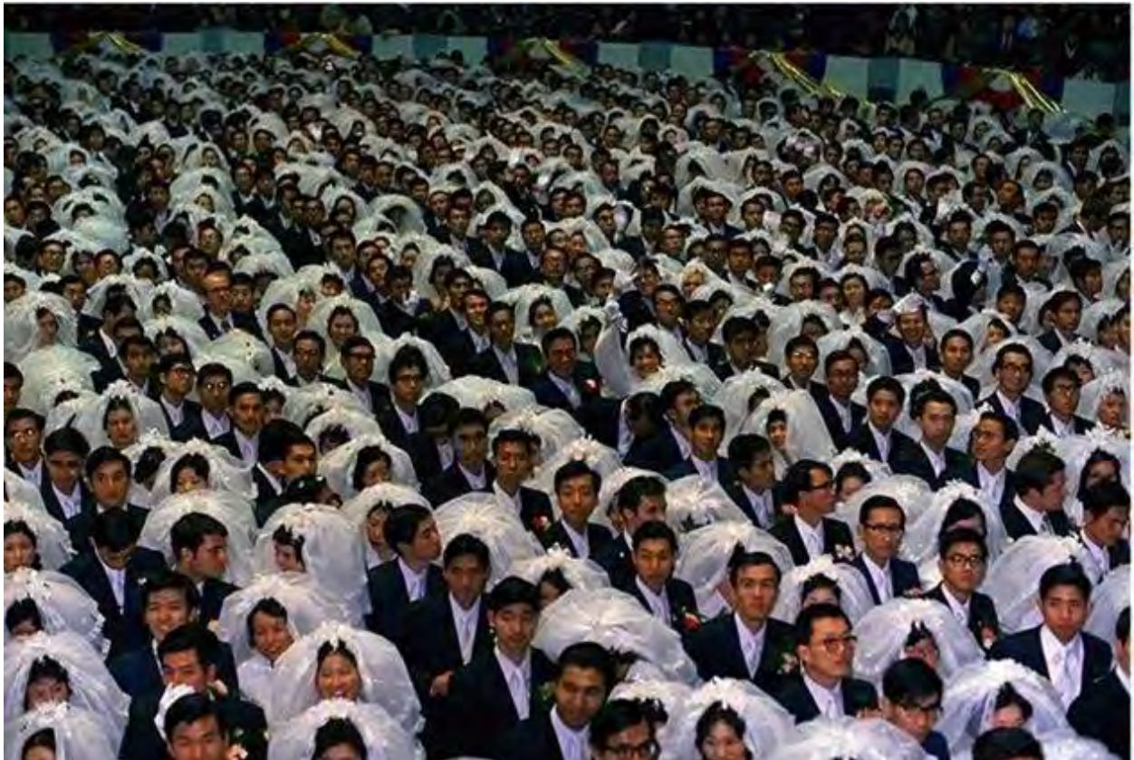
From the Marriage Blessing ceremony of the 1800 couples on February 8, 1975

The South Korean Minister of the Board of National Unification gave a congratulatory speech. More than 10,000 guests could watch the event. Straight afterwards, the couples boarded 94 sightseeing buses for a parade through the downtown streets of Seoul.