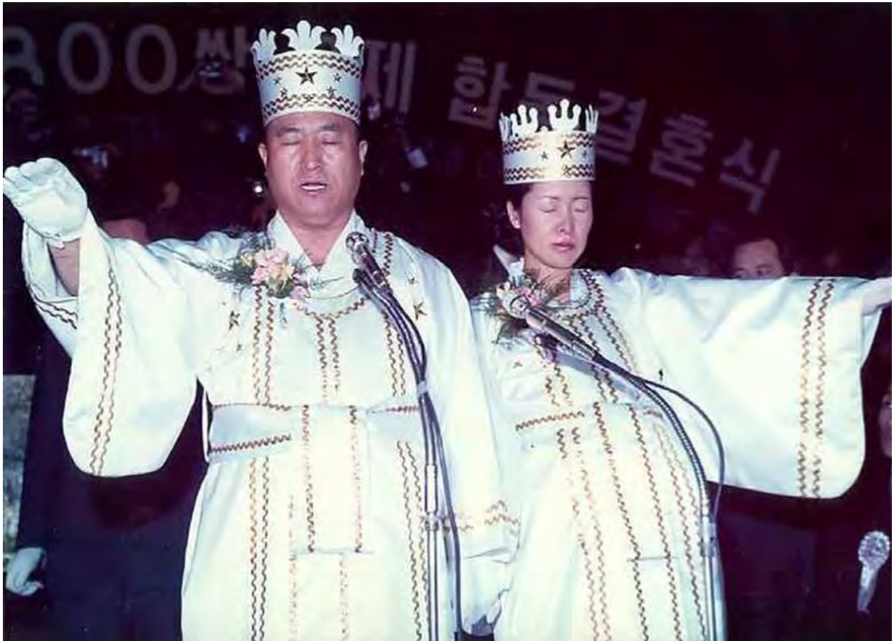
Father Moon and Mother Han praying for all the couples at the Marriage Blessing ceremony of the 1800 couples on February 8, 1975

This event remains a landmark in the history of the Family Federation , symbolizing its vision of spiritual and social transformation through family values .