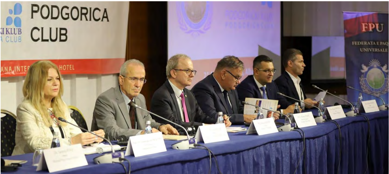
The panelists of the second session