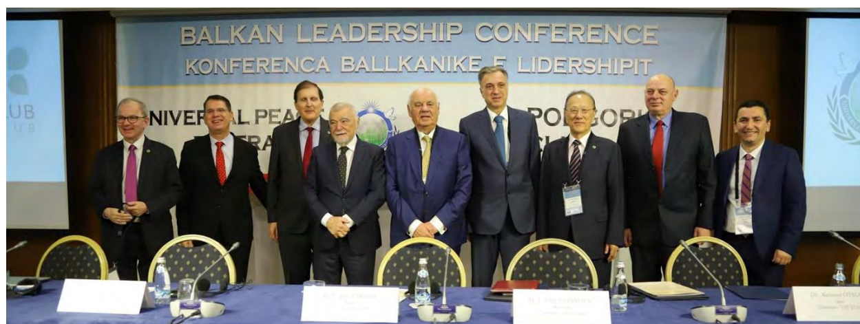
The panelists of the first session with UPF leaders

The panel discussion ended with congratulatory remarks from two former Balkan leaders.