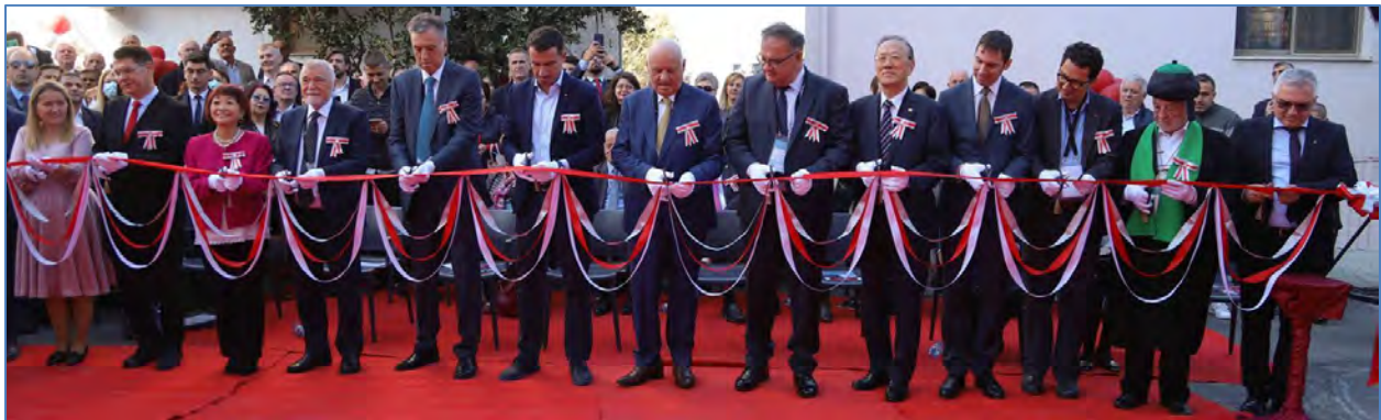
The Ribbon Cutting Ceremony

Approximately 300 people attended the inauguration, which was widely covered by the region's newspapers, television, and social media.