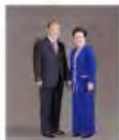
Cheon Seong Gyeong 천성경/天聖卿