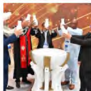
Peace Summit 2023