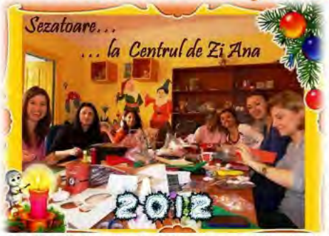
Volunteers from the Faculty of Psychology and Educational Sciences, Bucharest University

•Saturday/Sunday - organized groups: +40 21 223.55.93 - for scheduling a day