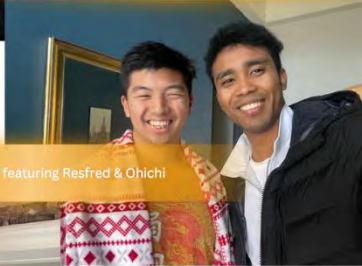
Random encounters - featuring Resfred & Ohichi