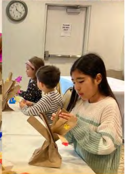
Sunday School: We started the story of Moses. As an activity, the kids made burning bushes with paper bags and colored paper.