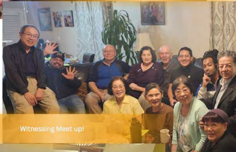
Witnessing Meet up!