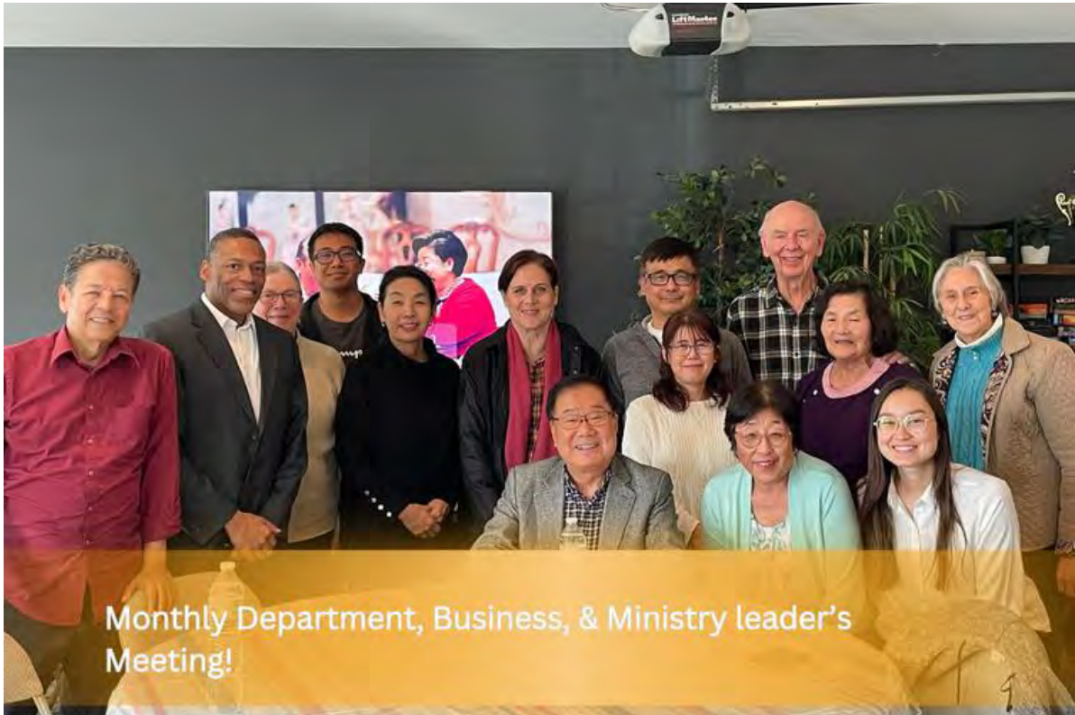
Monthly Department, Business, & Ministry leader's Meeting!