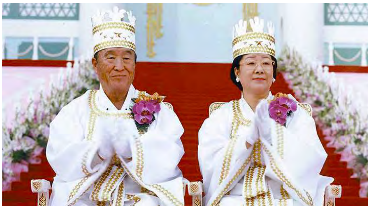
True Parents Bless 360 million couples in marriage.

True Parents blessed couples on a mass level during the 1990s. This was referred to as the “globalization” of the Holy Marriage Blessing and focused largely on previously married couples. Unificationists worldwide conducted marriage rededications, which then were sanctified by True Parents at International Marriage Blessings broadcast globally by satellite. On February 7, 1999, True Parents conducted the largest Blessing to date for 360 million couples. The main venue was Seoul Olympic Stadium which was packed with 100,000 participants, many of whom had been brought by 3,000 buses. Although conducted in mid-winter, the weather cooperated and conditions on the day of the ceremony were quite good. What was known as “Blessing 99” penetrated Korean society more powerfully than previous ceremonies, in