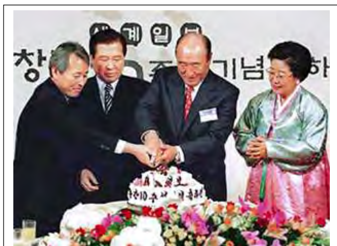
True Father founded the Segye ("universal") Times to be the "window on the world" for Koreans

In 1988, following South Korean President Roh Tae-woo's declaration of greater freedom and the Seoul Olympics, the number of newspapers in Korea doubled. True Father founded the Segye ("universal") Times . He intended it to be the "window on the world" for the Korean people. According to True Father: