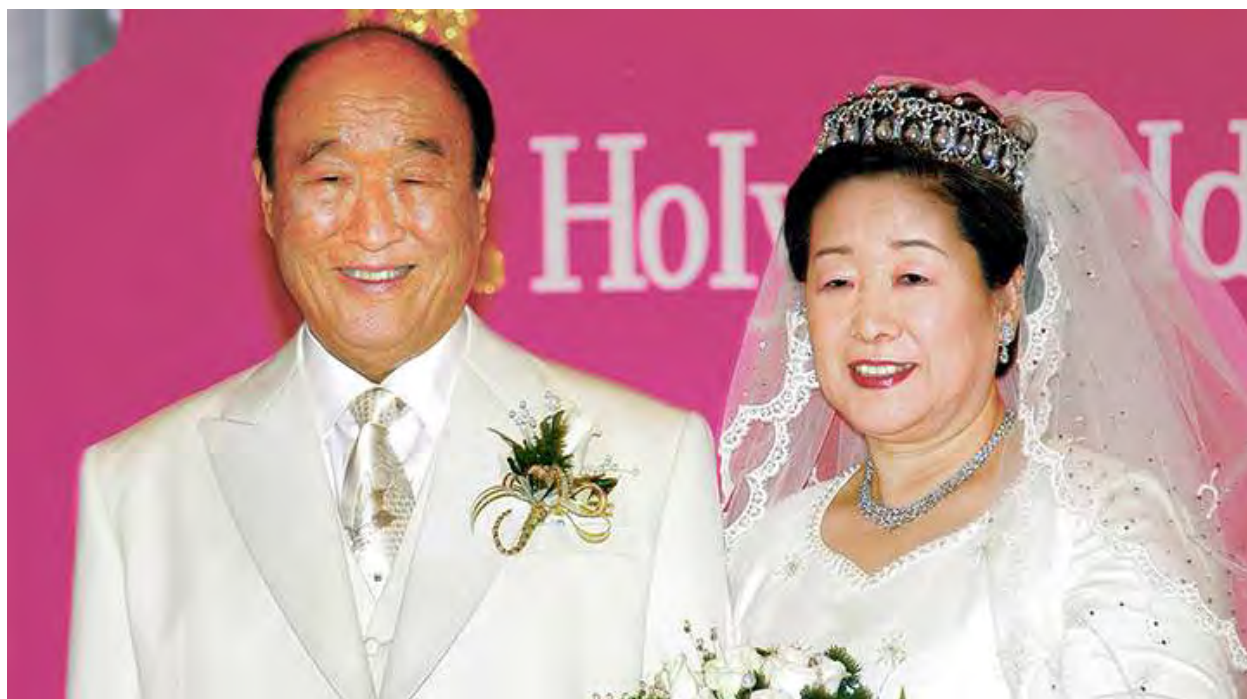
The Holy Marriage Blessing Ceremony for the Parents of Heaven and Earth Opening the Gate of Cheon Il Guk.

to the creation of a heavenly nation. For the next twelve years, True Parents set numerous conditions for the establishment of Cheon Il Guk . One of the most important of these was the Holy Marriage Blessing Ceremony for the Parents of Heaven and Earth Opening the Gate of Cheon Il Guk on February 6, 2003.