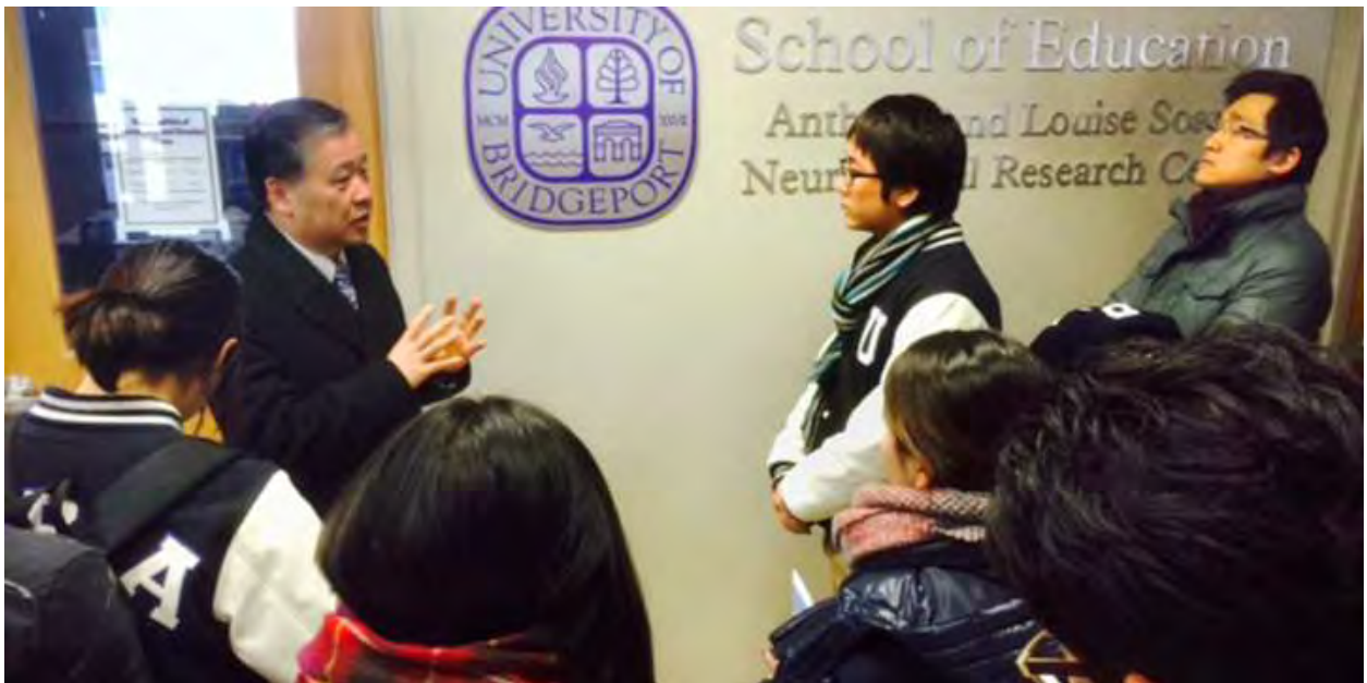
UPA students stop to listen and take notes in front of the School of Education on their tour of the University of Bridgeport.