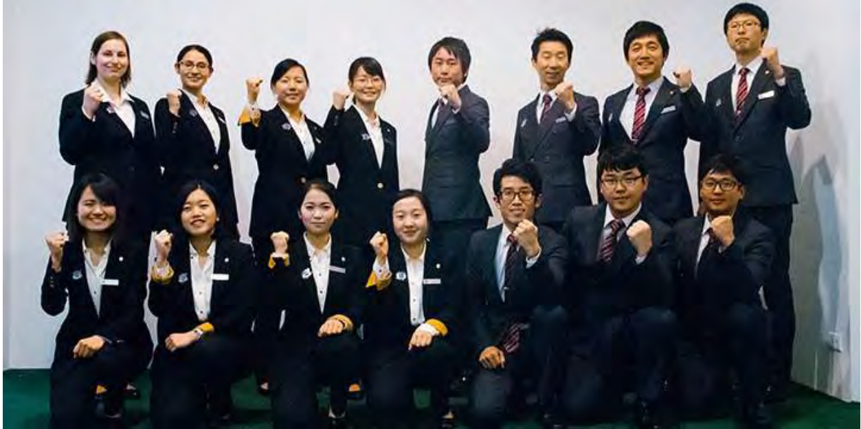
UPA students take a group photo at the finale of their closing ceremony

The Universal Peace Academy's (UPA) United States Heritage Tour culminated with a graduation ceremony for the 16 cadets on February 5, 2014 at the Learning Center on 43rd Street, NY. Along with testimonies and speeches, the participants viewed a slide presentation which highlighted their tour across the country from churches to national parks.