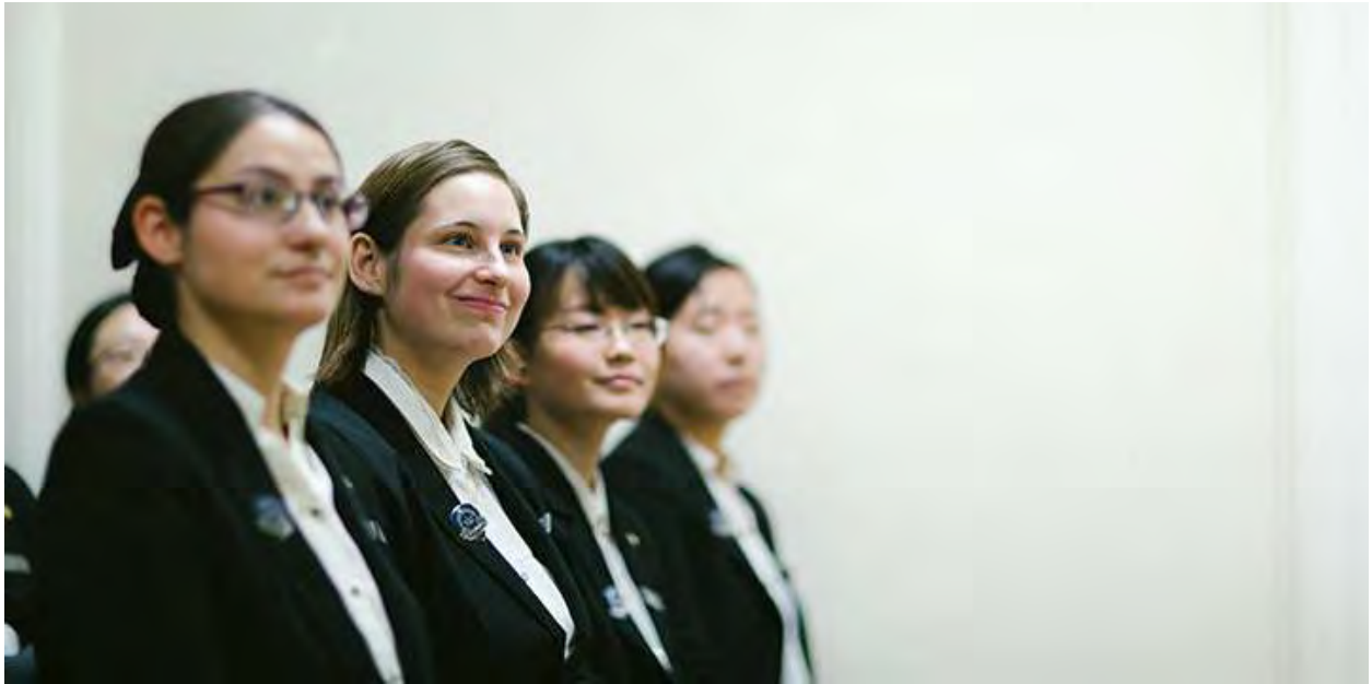
UPA Cadets proudly attend their closing ceremony.