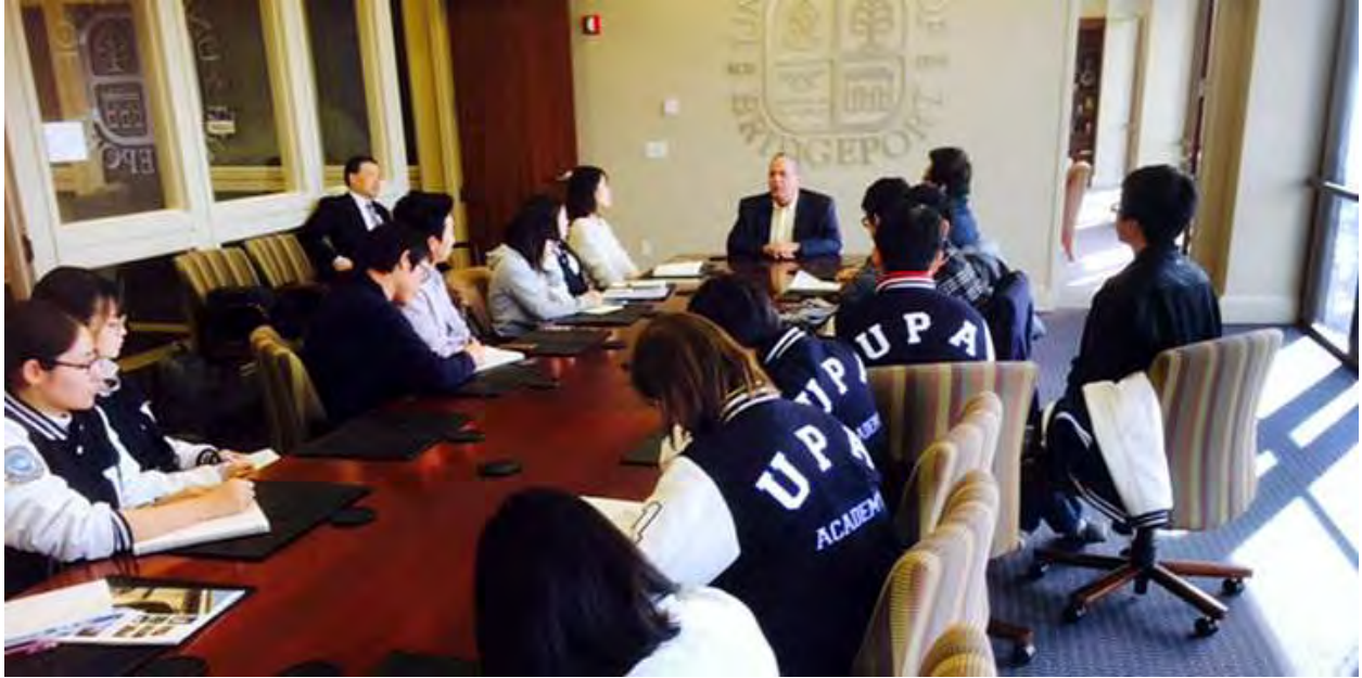
UPA students learn about the development and progress of the University of Bridgeport.