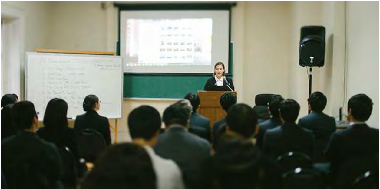
A UPA Cadet gives a testimony of her experience.