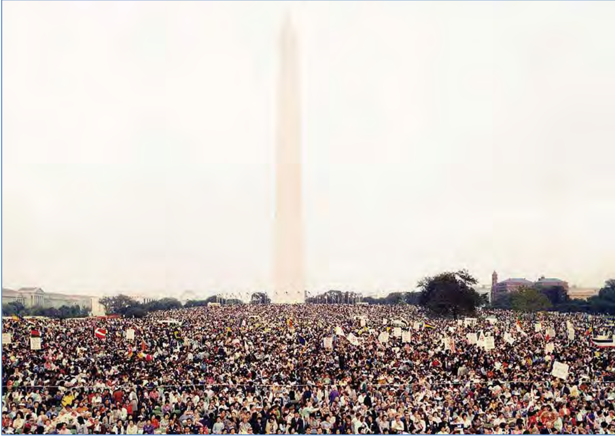
Rev. Moon holds an evangelist rally at The Washington Monument in Washington, D.C. on September 18, 1976.

Rev. Moon Delivers Address to 300,000 People at the Washington Monument Rally