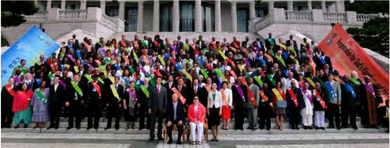
Newly bestowed with Korean surnames, 172 Ministers from the United States pose in a group photo with Rev. and Mrs. Moon, in front of the Cheon Jeong Gung Peace Palace in Korea.

A grand ceremony for bestowal of Korean surnames upon 172 ministers, 43 each from the North, South, East and West quadrants of the United States, came to Korea representing America, Christendom and the entire world, with the purpose of registering in God's Kingdom and testifying that God had anointed Father Moon. Going to Korea represented an offering of gratitude in return for everything True Parents have done for America and the world. In a strategic sense, the clergy, who understand and support Father Moon's historic mission from the point of view of 77 different religious denominations were united through a singular cause. By joining into and becoming part of a Korean family and exchanging names, they gave a powerful testimony to the Korean people of the fruits of Father Moon's work to remove all barriers between race and denomination. Through proclaiming that Korea is God's Homeland and Hometown, they affirmed that God had chosen this nation to be the base for the Kingdom of God and the family culture that honors elders and has fidelity and faithfulness in every aspect of the family – from marriage to the filial piety of children to their parents.