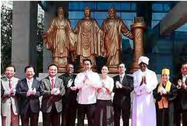
A statue of the four saints, the founders of the four major religions — Buddhism, Christianity, Confucianism and Islam—was unveiled at the Cheon Bok Gung main church in Seoul.