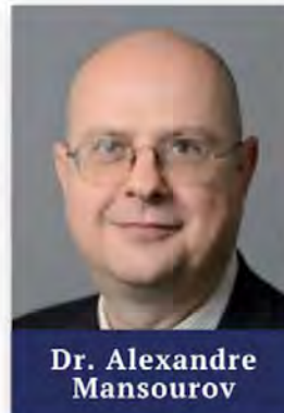
Professor, Center for Security Studies, Georgetown University