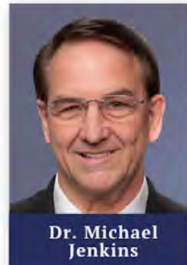
President, The Washington Times Foundation

Admiral Sam Paparo, head of the U.S. Indo-Pacific Command said China's aggressive maneuvers around Taiwan aren't exercises, they are rehearsals for the forced unification of Taiwan to the mainland. Is this likely? What will prevent China from using force?