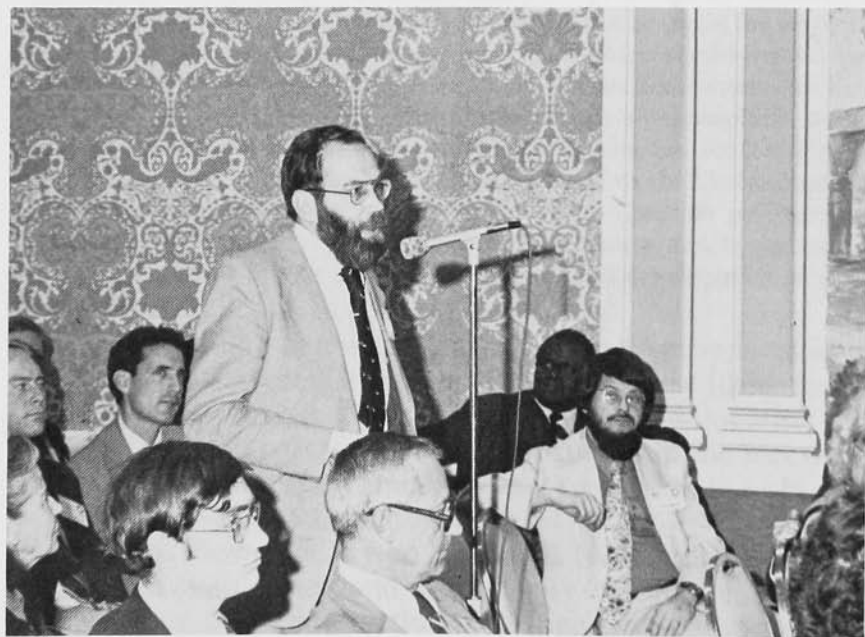
Speakers respond to a presentation.